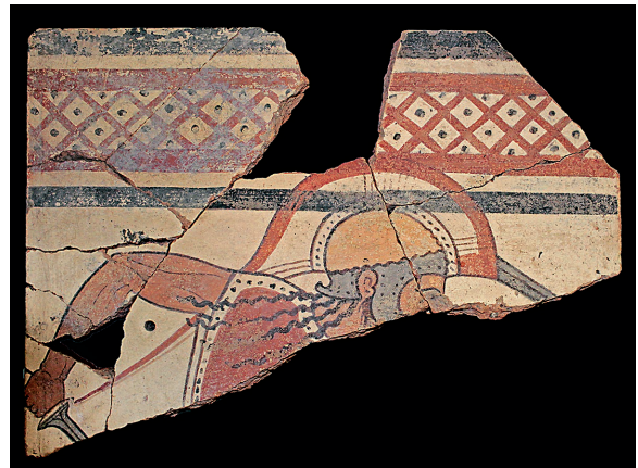
FIG. 3. Fragments of a painted tile in Colori degli Etruschi: Tesori di terracotta alla Centrale Montemartini , looted from Cerveteri in 1984 and recovered from Geneva free port (inv. no. 115541) (© Ministry of Culture, Italy; permission Soprintendenza Archeologia Belle Arti e Paesaggio per la provincia di Viterbo e per l'Etruria Meridionale).

While the above exhibitions focused on collecting, museums, and the protection of cultural property, others have looked at the contexts and politics of archaeological fieldwork and the ways in which its hierarchies continue to resonate in museums. As Stevenson's 2019 book Scattered Finds shows, there is much to be gained by moving back and forth between the field and the museum; actions in one sphere have consequences in the other. This is true both in archaeological work today and in the study of its history. Because looting, warfare, and environmental destruction all harm field sites, archaeological collections are all the more important. Museums are not apart from these dangers but are connected to them in broader histories and networks. Both museums and fieldwork need to be seen in the wider context of world events. As stewards of archaeological collections, museums