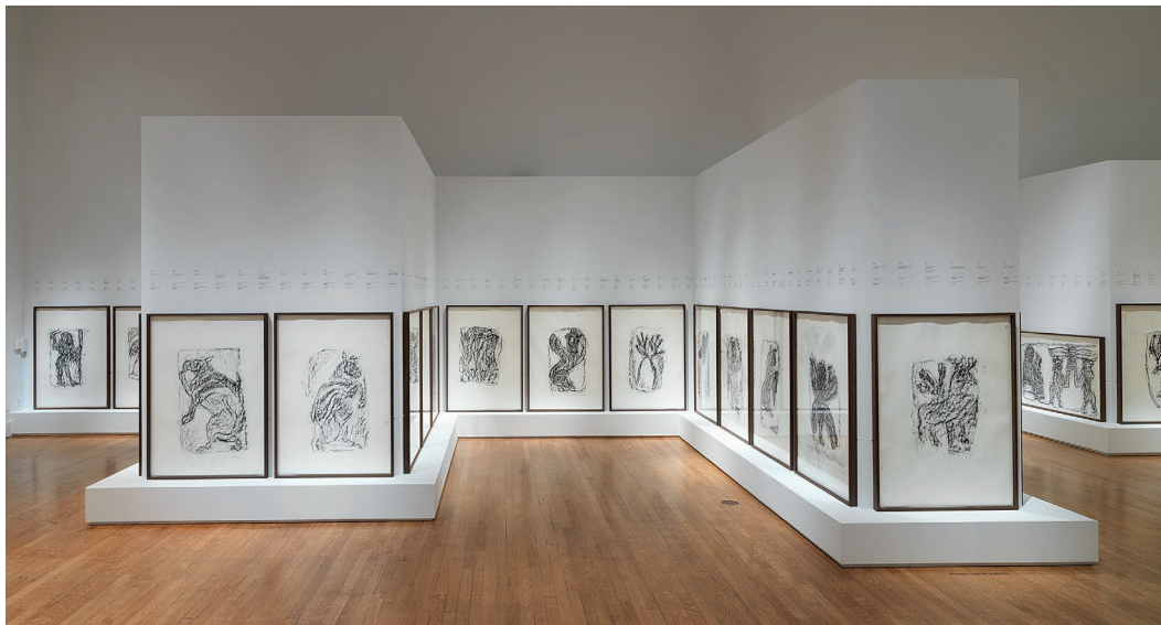
FIG. 9. Installation view of Rayyane Tabet Alien Property at the Metropolitan Museum of Art showing Rayyane Tabet, Orthostates , 2017.