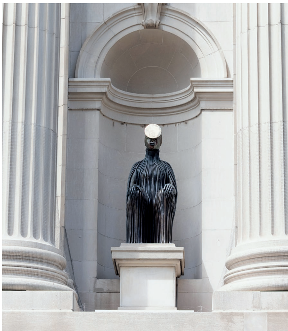
FIG. 6. Wangechi Mutu, The Seated IV , 2019, bronze, from The NewOnes, will free Us , on the facade of the Metropolitan Museum of Art, New York.

During the piece, Attia shattered museum cases with bricks and stones, reflecting the fragility of museum objects, the abuse of cultural patrimony, and the ways