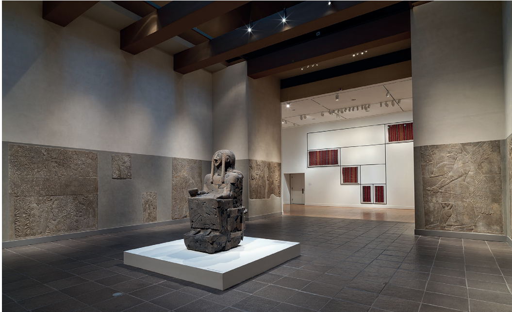
FIG. 8. Installation view of Rayyane Tabet Alien Property (2019–21) at the Metropolitan Museum of Art with basalt statue of a seated figure from Tell Halaf (Max Freiherr von Oppenheim-Stiftung; excav. 1912, see n. 46).

museum on the island of Delos. Gormley placed 29 iron figures in sites that activated the island's geologic and human topographies and timeframes (fig. 10). 48 Standing at the water's edge, on geological features, among the archaeological remains, and in the museum, the body-forms animated the transhistorical palimpsest that is the island. Although the body-forms have formal affinities with archaic kouroi, they come from a different world. Realistic, cast in iron, rusty, and industrial, they offered no stories. Rather, as emblems of the space in which the human body exists, these figures resonated with the sea, the rocks, the ancient statues, and the stone blocks resurrected by archaeologists.