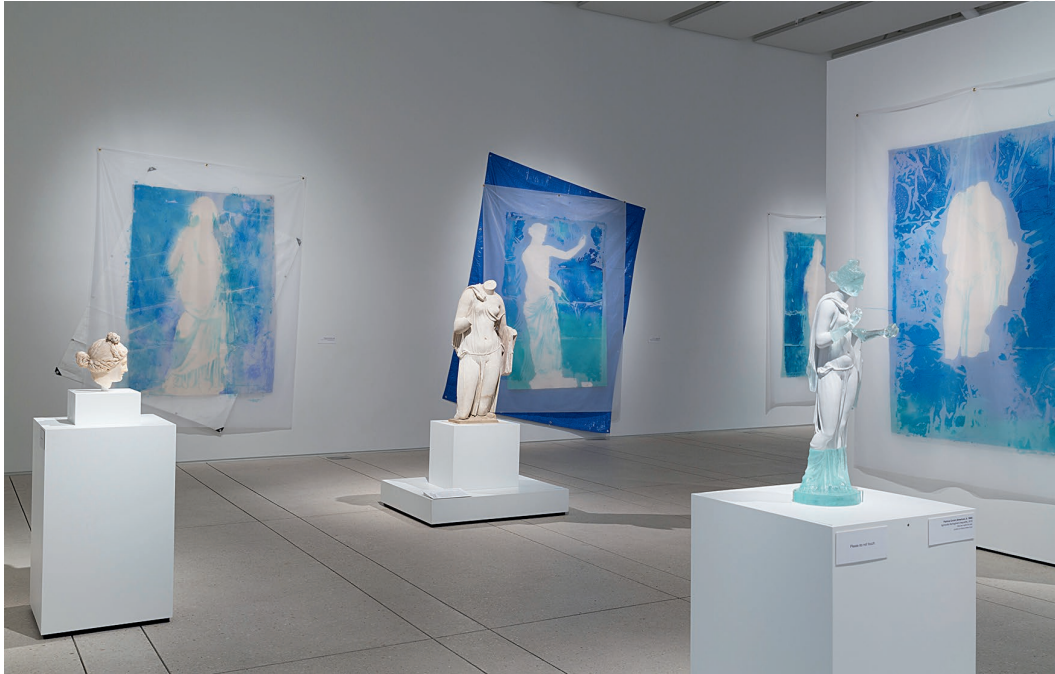
FIG. 5. Installation view of Patricia Cronin, Aphrodite, and the Lure of Antiquity: Conversations with the Collection.