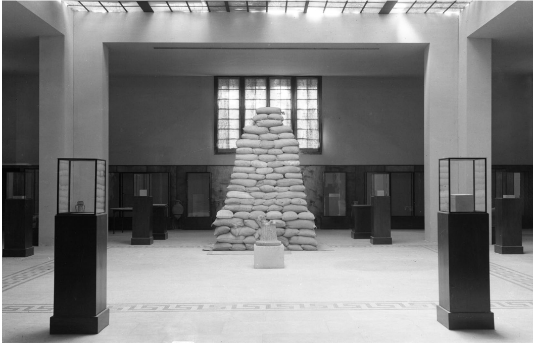
FIG. 2. Photograph from Arqueologia a l'exili. El Museu d'Arqueologia de Catalunya i la Guerra Civil espanyola (1936–1939) showing interior of the Empúries Room with the statue of Aesculapius protected by sandbags, late 1937–early 1938 (Aesculapius: Empúries, Museu d'Arqueologia de Catalunya MAC EMP-11530/11532, excav. 1909; photograph attrib. R. Sagarra MAC AHF no. CC158).

and use of terracotta plaques in antiquity as well as the legal, diplomatic, and scholarly labor involved in the recovery and repatriation of cultural heritage. 28