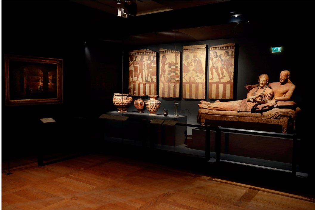
FIG. 1. Gallery view of Un rêve d'Italie. La collection du marquis Campana with Campana Plaques, ca. 530 BCE (Paris, Musée du Louvre Cp 6625, Cp6624, Cp 6626, Cp 6628, Cp 6627) and Sarcophagus of the Spouses, ca. 520–510 BCE (Louvre Cp 5194), discovered probably 1845–46 at Cerveteri, Banditaccia Necropolis (© Musée du Louvre, Département des Antiquités grecques, étrusques et romaines, 2018).

Archaeology @ U-M: 1817–2017 (2017–18), a joint exhibition put on by the University of Michigan Museum of Anthropological Archaeology (UMMAA) and the Kelsey Museum of Archaeology, for instance, placed the history of collecting at two institutions that arose from different academic traditions side by side. While the UMMAA holds a collection rooted in natural history collecting, colonialism, and the beginnings of the discipline of anthropology, the Kelsey's collection has its origins in classics and biblical studies. 17 The exhibition followed the history of the two museums by tracing accounts of scholars, fieldwork, and acquisitions and by examining the roles of archaeological research and collections in the production and accumulation of knowledge. Acquisitions and field projects filled the museums with tens of thousands of artifacts. The different collections amassed over time reflect shifting paradigms; they tell a story of the movement of both museums and disciplines toward increasingly