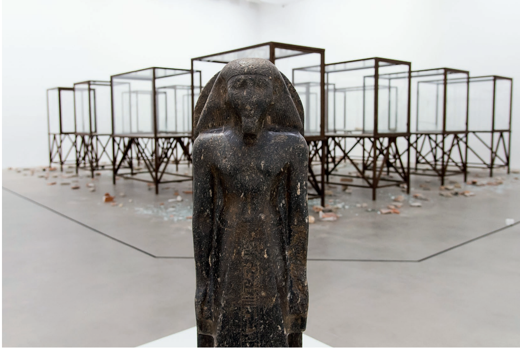
FIG. 7. Installation view of Kader Attia, Arab Spring , 2014, along with a statue of Hapu, third lector priest of Amon (1482–1458 BCE; Turin, Museo Egizio 3061, acq. before 1882), from Anche le statue muoiono. Conflitto e patrimonio tra antico e contemporaneo at the Fondazione Sandretto Re Rebaudengo.

The fragmentation continued. In 1930, von Oppenheim opened the Tell Halaf Museum in Berlin. The following year, he brought eight orthostats to New York, probably with the intention of selling them, but, unable to do so, he left them in storage. In 1943, the Allies bombed Berlin, including the new Tell Halaf Museum, reducing it—and its contents—to rubble (an example of the dangers of stewardship in Western museums). Meanwhile, the U.S. government confiscated the eight orthostats in New York as enemy property and sold them to The Met, which in turn, sold four reliefs to the Walters Art Museum. The Met's exhibition brought the museum's reliefs together with archival materials, a recently reconstructed Neo-Hittite statue from the bombed Tell Halaf Museum (fig. 8), and works by the artist Rayanne Tabet, whose great grandfather, Faik Borkhoche, served as von Oppenheim's secretary during the excavations. 46 Tabet's work