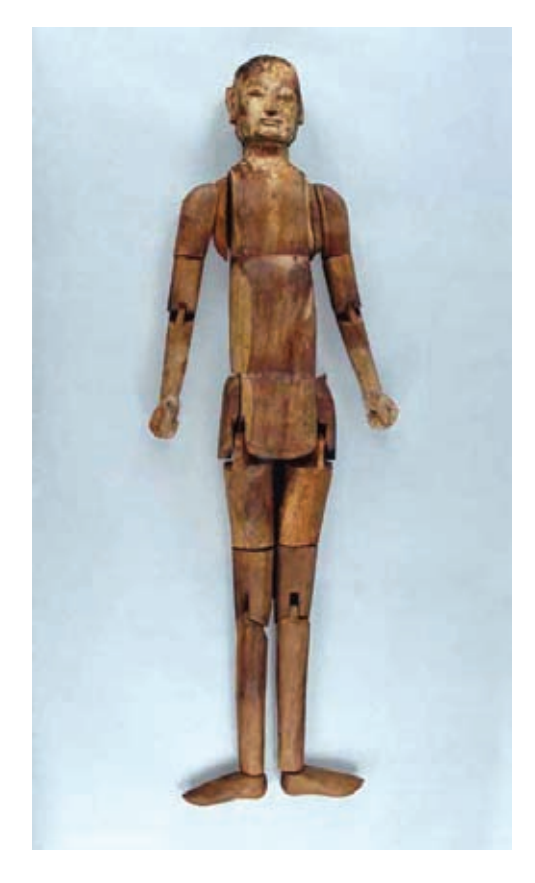
Fig. 7. Mannequin, Liao dynasty, 11th or early 12th century, from a tomb at Yihenuoer Township, Balin Right Banner. Wood, ht. 180 cm.