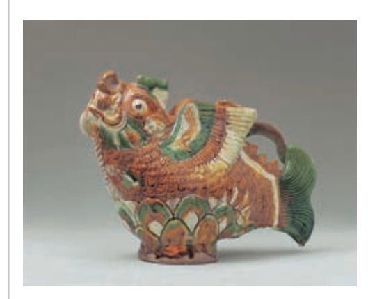
Fig. 10. Ewer in the form of a fish-dragon, Liao dynasty, second half of the 11th century, from Kezuo Central Banner, Tongliao City. Lead-glazed earthenware, ht. 22.3 cm, lgth. 30 cm, diam. of base 9 cm.

Several computer monitors are on-site for further exploration of Qidan-Liao history and for an interactive experience of viewing select objects from different angles or close-up.