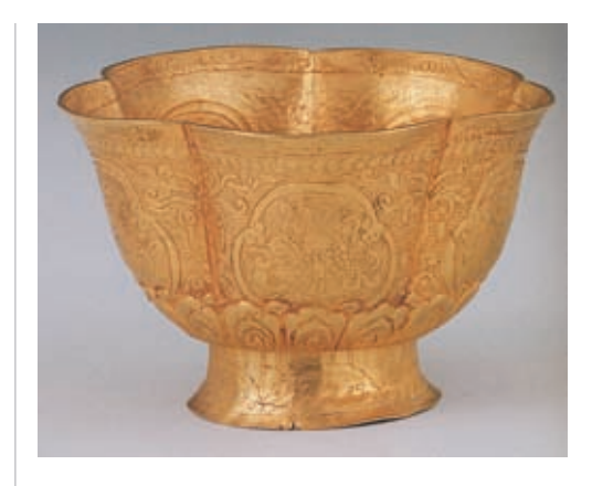
Fig. 9. Five-lobed cup decorated with ducks and fish, Five Dynasties, 10th century, before 942, from the tomb of Yelü Yuzhi and Chonggun at Hansumu Township in Aluke'erqin Banner. Gold, ht. 4.9 cm, diam. of mouth 7.3 cm, diam. of base 4 cm.