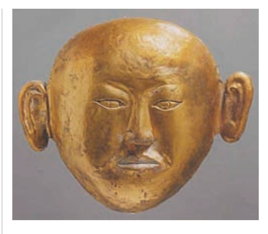
Fig. 2. Burial mask, Liao dynasty, 1018 or earlier, from the tomb of the princess of Chen and Xiao Shaoju at Qinglongshan Town in Naiman Banner. Gold, lgth. 20.5 cm, wdth. 17.2 cm, thickness 0.05 cm.