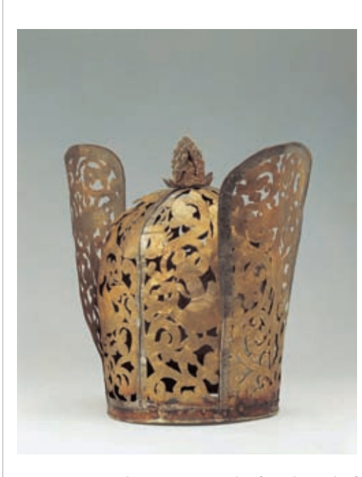
Fig. 3. Crown, Liao dynasty, 1018 or earlier, from the tomb of the princess of Chen and Xiao Shaoju at Qinglongshan Town in Naiman Banner. Gilded silver, ht. 30 cm, diam. 19.5 cm.

services on the Ancestral Mountain (Zushan in Balin Zuoqi, Inner Mongolia).<sup>13</sup> The silver boots