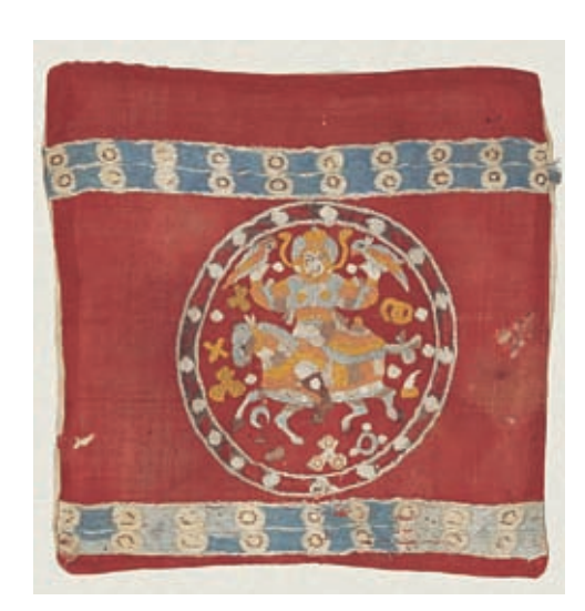
Fig. 8. Red sutra wrapper embroidered with a rider in a pearl roundel, Liao dynasty, 1049 or earlier, excavated from the White Pagoda in Balin Right Banner. Silk, gauze, tabby, embroidery with silk threads, Igth. 27.7 cm, wdth. 27 cm.