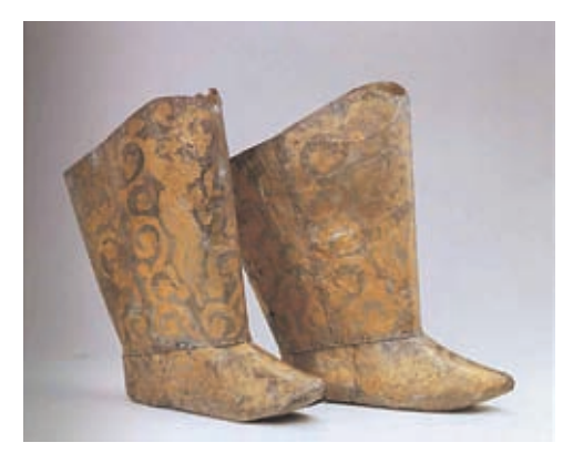
Fig. 4. Pair of boots, Liao dynasty, 1018 or earlier, from the tomb of the princess of Chen and Xiao Shaoju at Qinglongshan Town in Naiman Banner. Gilded silver, Igth. 29.2 cm, ht. 37.5 cm.

The focus of the following section, "Religious Life" (cat. nos. 59–75), is on Buddhism. The first item of the section, an embroidered silk textile in red (cat. no. 59; fig. 8), is a rare piece, partly because of the high perishability of the material. The central figure is a man riding in full frontal view on a "horse," with each hand holding a large bird identified as a falcon. The curved beak and the general nonthreatening appearance of the bird on the right seem to suggest a parrot. Even the "horse" with its long ears looks more like a donkey or mule. The whole image is framed by a pearl roundel. There is little doubt that the compositional structure is Sasanian in origin. But the scattered emblems on the ground defy precise identifica-