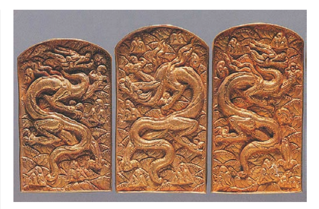
Fig. 5. Belt set with dragon design, Liao dynasty, 1018 or earlier, from the tomb of the princess of Chen and Xiao Shaoju at Qinglongshan Town in Naiman Banner. Gold; each plaque lgth. 10.6–12.4 cm, wdth. 6.2 cm.

mantras was a key feature of Tantrism, which had spread to China from India in Tang times. These artifacts attest to the continued appeal of Tantrism in Qidan-Liao.