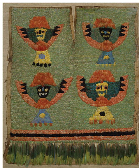
Fig. 3. Chimú tabard, cotton and feathers, 15th–16th century, lgth. 76.2 cm, wdth. 63.5 cm. New York, the Metropolitan Museum of Art, Fletcher Fund, 1959, 59.135.8.

Similar in size to the great tabards are oversized rectangular hangings, consisting of solid yellow and blue feathered areas, whose function is not known (see fig. 1). Close to 100 of these panels are preserved, each one about 203.2 cm (80 in) long: the five variously colored examples in the exhibition have been drawn