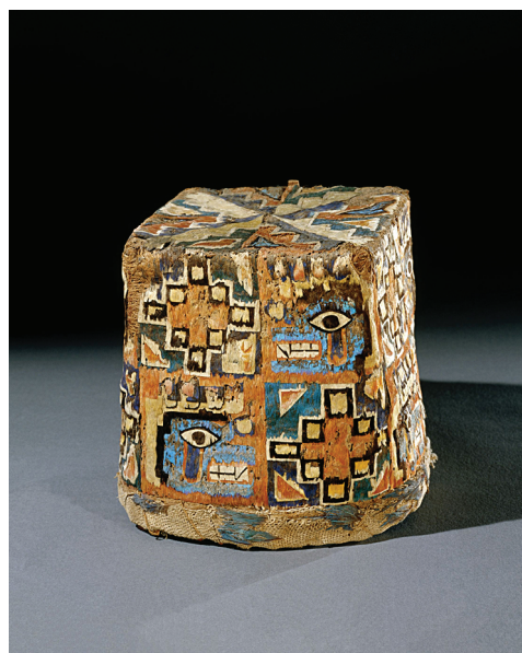
Fig. 2. Wari four-cornered hat, cotton, cane, and feathers, seventh–eighth century, ht. 17.145 cm. New York, Brooklyn Museum, A. Augustus Healy Fund, 41.228.

birds and fish, are benign and ornamental. The same can be said of Chimú textiles, whose designs are often simply geometric. The layout of the royal compounds likewise suggests that Chimú rulers were powerful without resorting to power imagery. Instead, the Chimú seem to have emphasized luxury: splendid textiles, gold earplugs, "crowns," collars, and especially