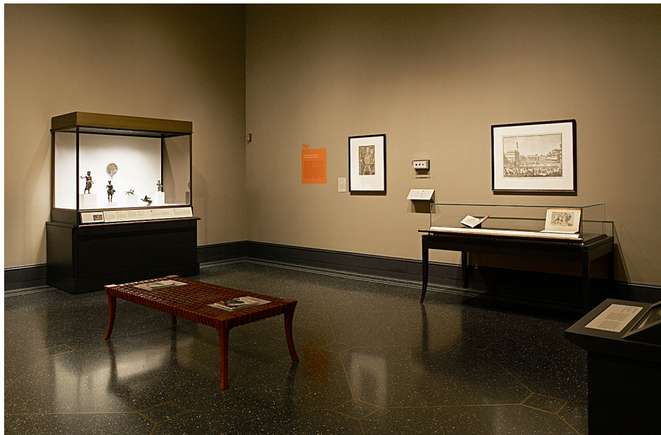
Fig. 3. Installation view of the exhibition's right side: left background , case with Etruscan small bronzes; middle-ground , bench with catalogues; center background , wall-mounted case with ancient coins; right background , 16th–18th-century illustrated books, an engraving, and a manuscript documenting the Chimaera of Arezzo's western afterlife (E.M. Rosenbery).

the Chimaera statue “was created in a workshop that included craftsmen immersed in the artistic ambience of the Greek colonies in the Southern Italian peninsula as well as Etruscan metal-workers famed for their expertise in bronze casting.” The placard on the Chimaera’s back flank deals with visual evidence for the statue’s iconographic context in a sculptural group also containing a statue of Bellerophon on Pegasus. The last placard, at the tail end, discusses the statue’s early modern history, from its discovery in Arezzo and the reattachment of its original ancient left front and rear lower legs to the modern restoration of its tail with the snake’s head biting the goat’s horn in 1785. (Most visitors, transfixed by this “cool” detail, do not read far enough to learn that it is a restoration.) Interesting false-color x-radiographs on this last placard, which should have been reproduced larger, show repairs and the statue’s internal construction.