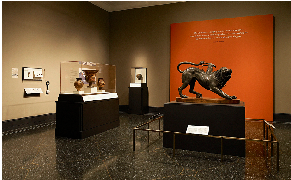
Fig. 1. Installation view of the exhibition: right , the Chimaera of Arezzo; left , cases with ancient vases, gems, and finger rings (E.M. Rosenbery).