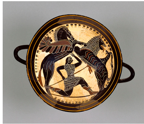
Fig. 4. Laconian black-figure cup with Pegasus, Bellerophon, and the Chimaera, diam. (without handles) 18.5 cm, ca. 565 B.C.E. Attributed to the Boreads Painter. Malibu, Villa Collection of the J. Paul Getty Museum, inv. no. 85.AE.121.1.

The issue of the Chimaera’s gender may be relevant for a Getty object strategically placed in the corridor outside the exhibition’s entrance to lure museum visitors: an archaic Laconian black-figure cup attributed to the Boreads Painter (fig. 4). 33 In a heraldic composition on the large tondo inside this Spartan cup, Pegasus, rearing on his hind legs, confronts the Chimaera. Here, a dismounted Bellerophon, advancing in a knielauf pose, spears the fearsome creature in the belly, and red blood spurts from the wound. This Chimaera is said to have a “shaggy belly,” following Stibbe’s