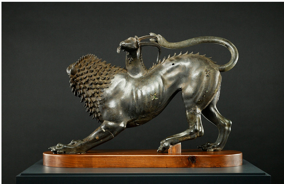
Fig. 2. Rear view of Etruscan bronze statue of the Chimaera, from Arezzo, lgth. 129 cm, ca. 400 B.C.E. Florence, Museo Archeologico Nazionale, inv. no. 1 (E.M. Rosenbery; © Soprintendenza per i Beni Archeologici della Toscana–Museo Archeologico Nazionale, Firenze).