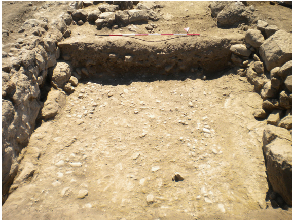
Fig. 3. Gabii, Area A, Road 3, detail of one of the road surfaces (via glareata), view from the north.