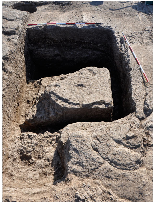
Fig. 4. Gabii, Area A, view of an assay pit dug in the bedrock south of the large quarry, from the west. Note the almost completely carved block, which was left on the bottom of the pit after being damaged.