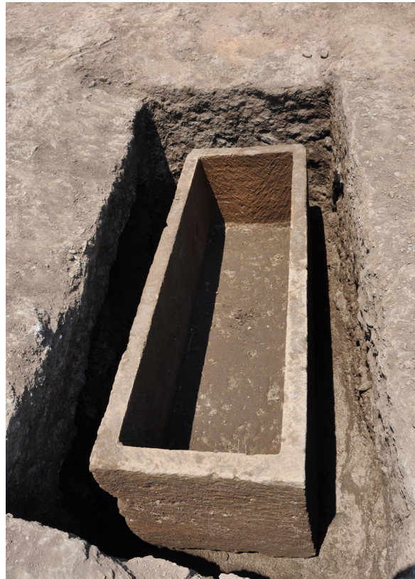
Fig. 2. Gabii, Area D, Tomb 25, view of tuff sarcophagus after removal of the human remains found inside it and of the fill of the tomb around it, from the south.