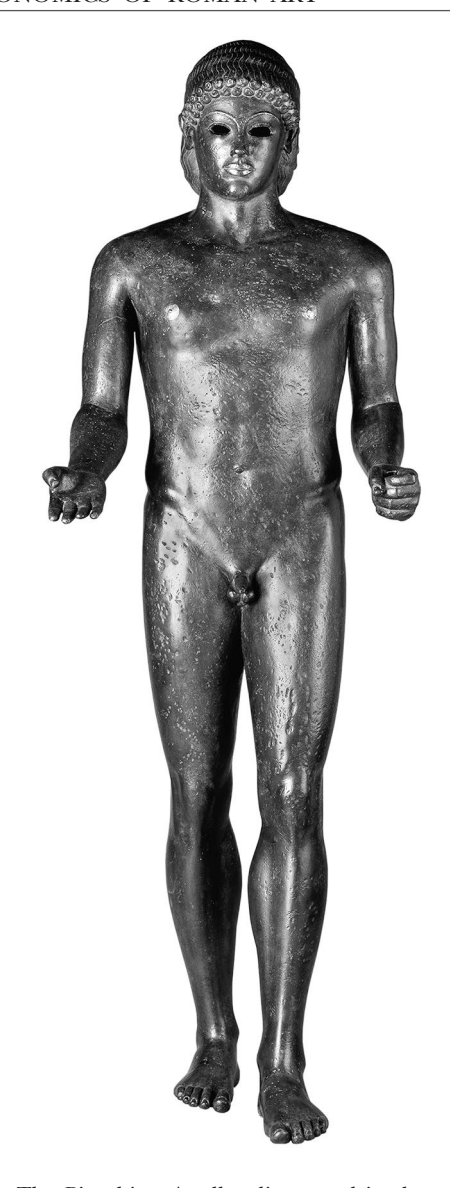
FIG. 3. The Piombino Apollo, discovered in the sea near Piombino, probably from the first century B.C.E. Paris, Musée du Louvre, inv. no. Br 2.

First, let us consider some factors that point in the other direction, factors that suggest that markets were overwhelmingly local. The scholars who think there was little economic integration in general seem to have a strong hand, since both transport and information were so slow-moving. The high cost of land transport, especially, has been much commented on (its significance has sometimes been exaggerated). 130 Not surprisingly, therefore, there was a strong tradition virtually everywhere of local craftsmen more or less satisfying local tastes and demand. In Lucian's famous Somnium (7), when the personification of Sculpture competes with Paideia for Lucian's attention, one of her arguments in favor of his becoming a sculptor is that in this way he can pursue his career in his hometown, Samosata. Herculaneum and Pompeii were cosmopolitan places a few miles apart, but the stylistic differences between their respective paintings strongly suggest that each was devoted to its local artists, or at