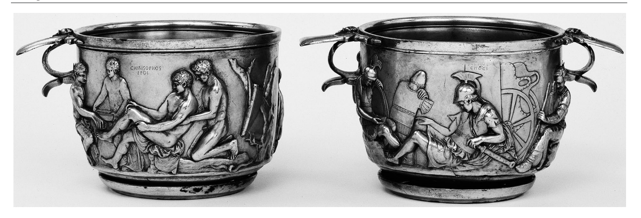
FIG. 2. The Hoby cups, from Hoby, Denmark, first century B.C.E. Copenhagen, National Museum.

dried up in the Late Republic:<sup>106</sup> everyone resorted to imitations and/or classicizing works. Concrete evidence of this is provided by the large officina at Baiae studied by Landwehr and others.<sup>107</sup> The plaster casts found at that site (more than 400 from at least 30 different statues) must have been used to make trueto-scale marble copies of famous and not so famous statues of the fifth and fourth centuries B.C.E.