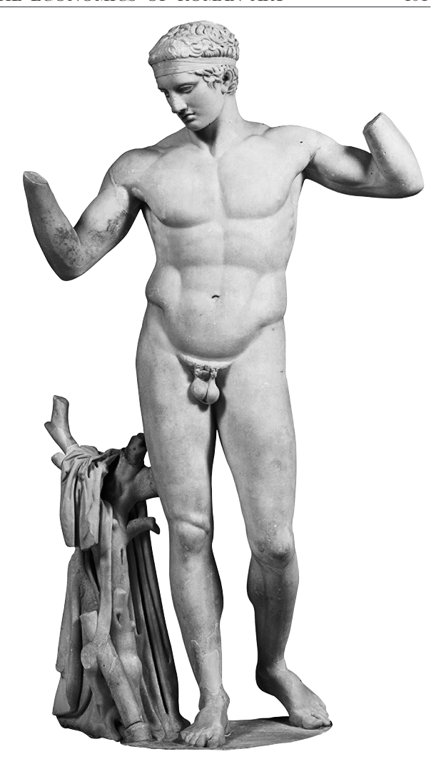
FIG. 1. Statue of the Diadoumenos from the House of the Diadoumenos, Delos, ca. 100 B.C.E. Athens, National Archaeological Museum, inv. no. 1826.

Roman taste was now overwhelmingly Greek, but the prospects for plundering Greeks were coming to an end. Supply and demand now operated in a largely peaceful fashion (with what effects I consider later). But the prices paid by Caesar and Agrippa were never, as far as we know, matched again by persons other than