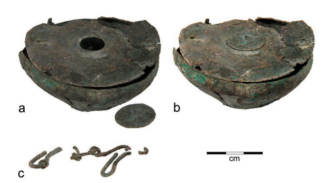
FIG. 3. Parts of a bronze inkwell from Tel Kedesh: a, bowl with small cover removed; b, bowl with small cover in place; c, fragments of a chain that probably once stretched across the top of the lid.