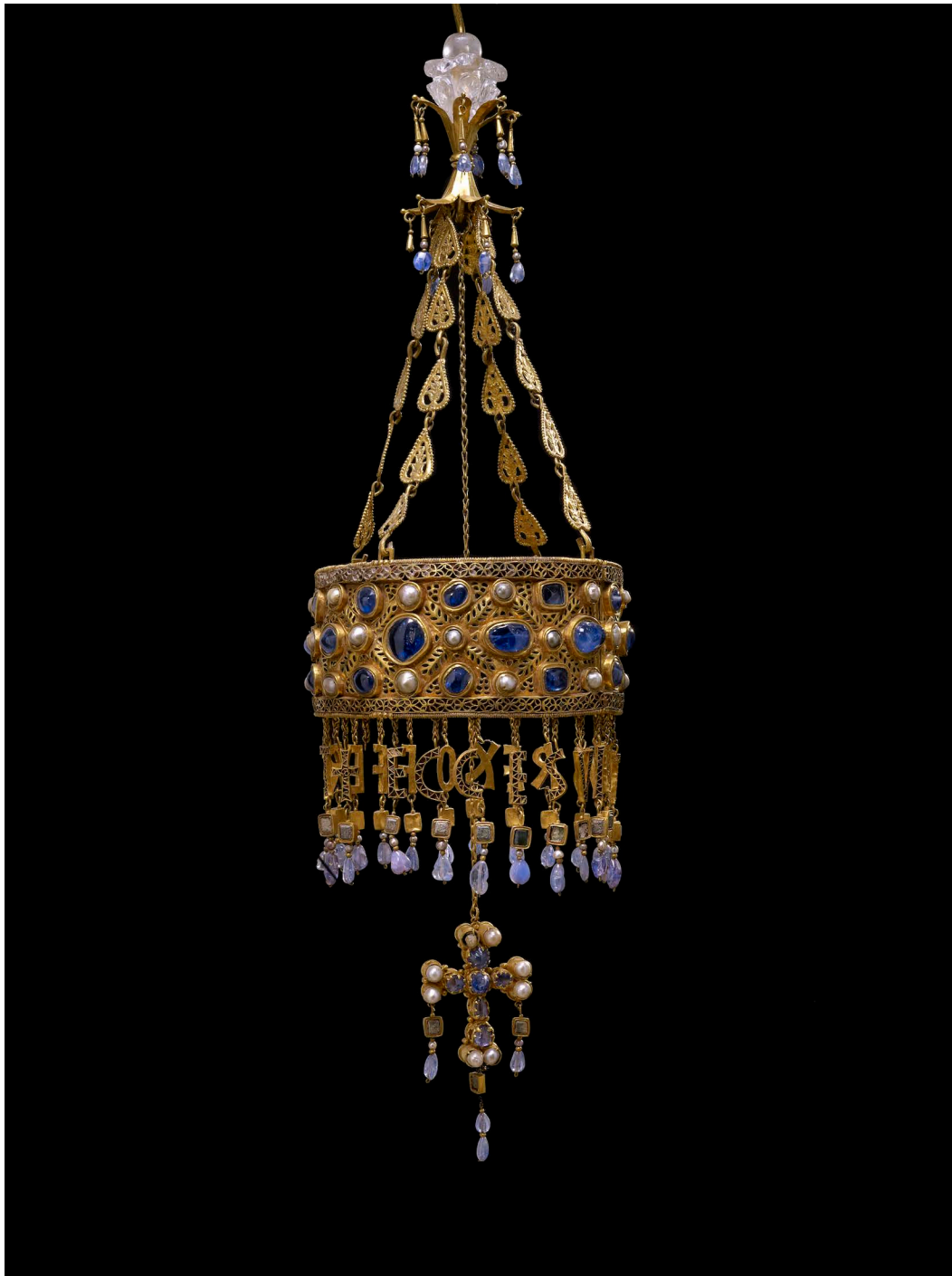
FIG. 2. Votive crown of King Reccesvinth from the Guarrazar Hoard, Visigothic, 621–672 C.E., gold, precious stones, pearls, rock crystal, Guarrazar (Guadamur, Toledo). Madrid, Museo Arqueológico Nacional, inv. no. 71202 (Santiago Relanzón; courtesy Museo Arqueológico Nacional, Madrid).