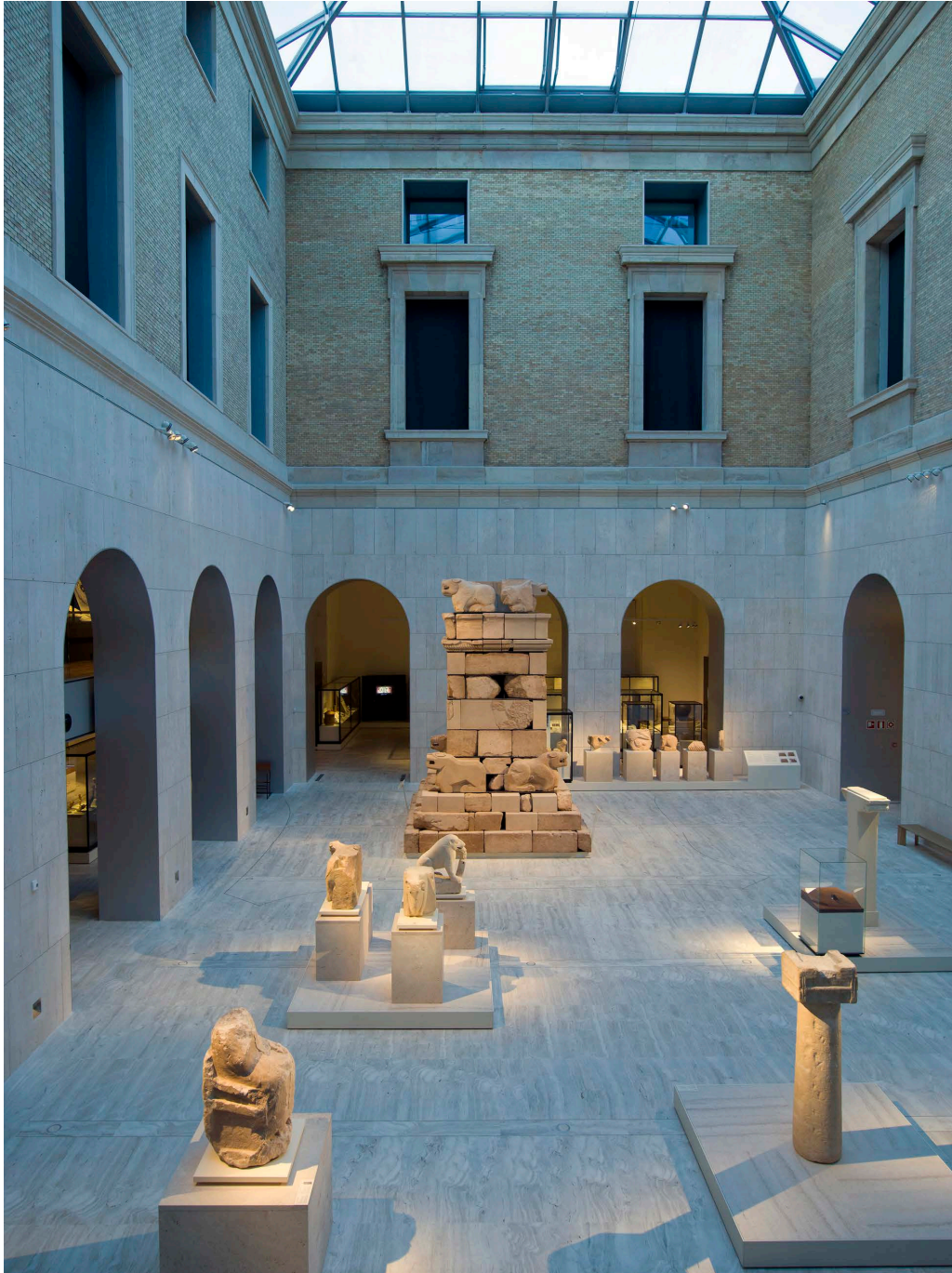
FIG. 1. North patio with funerary monument of Pozo Moro, Iberian culture, sixth century B.C.E., sandstone, Necropolis of Pozo Moro, Chincilla de Monte-Aragón (Albacete).

Images are not edited by the AJA to the same level as those in the published article.