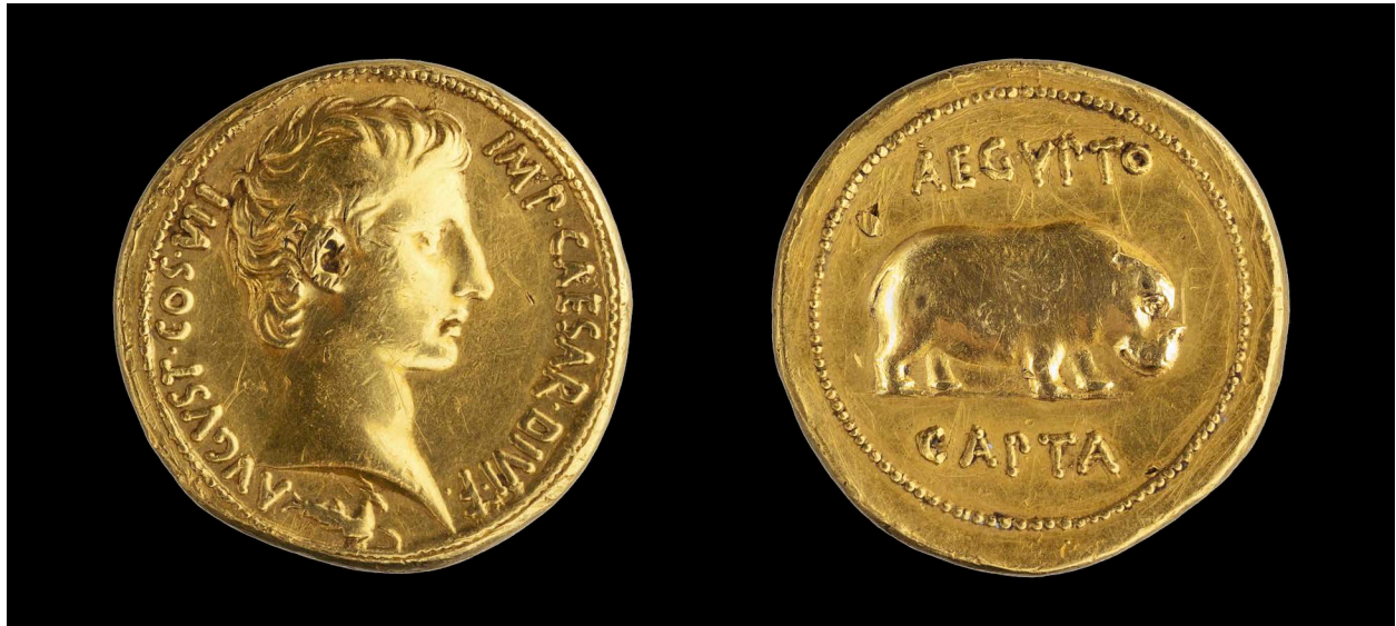
FIG. 5. Quaternion of Augustus, 27 B.C.E., gold, Pergamon(?). Madrid, Museo Arqueológico Nacional, inv. no. 1921/9/1.