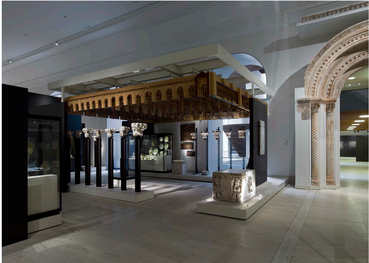
FIG. 4. The Al-Andalus section of the Museo Arqueológico Nacional's "The Medieval World" gallery, with a scale model of the Great Mosque at Córdoba made by Jordi Brunet, 1971, wood. Madrid, Museo Arqueológico Nacional, inv. no. 2001/83/1.