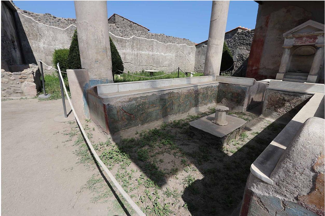
FIG. 3. The Casa dell'Efebo water triclinium, facing southeast, with view of the interior faces of the eastern and southern benches (D. Zarzycki).