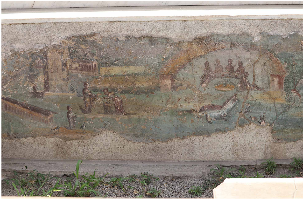
FIG. 14. Detail of the interior face of the western bench of the Casa dell'Efebo water triclinium. Visible features include those labeled on print-published fig. 11 as A, B, C, D, E, F, U, and V.