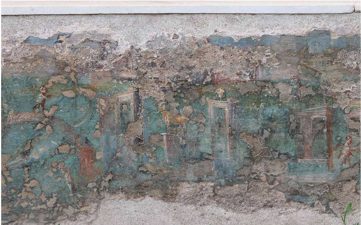
FIG. 8. Detail of the interior face of the eastern bench of the Casa dell'Efebo water triclinium (D. Zarzycki). Visible features include those labeled on print-published fig. 7 as F, G (now mostly destroyed), K, H (mostly destroyed), and I.