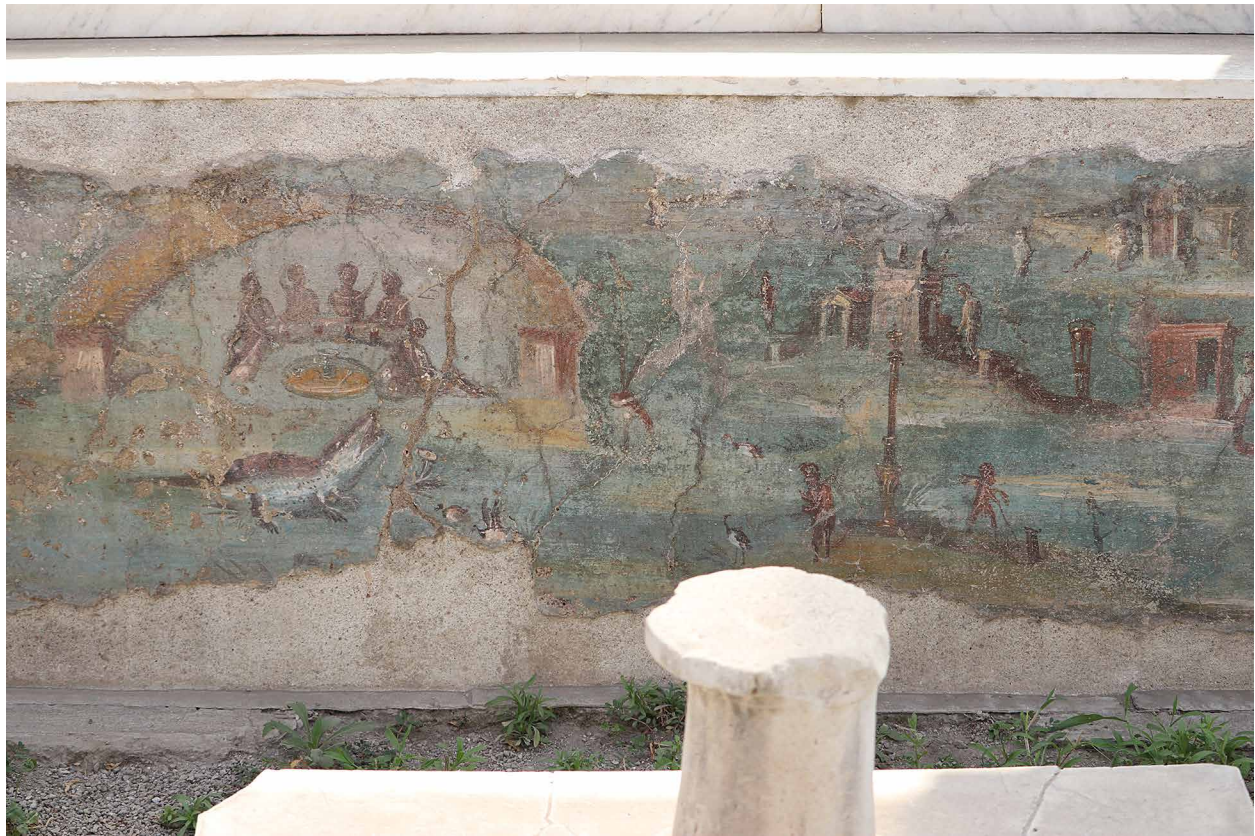
FIG. 15. Detail of the interior face of the western bench of the Casa dell'Efebo water triclinium. Visible features include those labeled on print-published fig. 11 as D, E, F, G, H, I, J, K, L, M, N, and V.