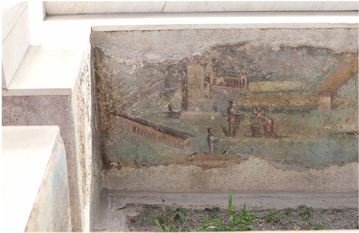
FIG. 13. Detail of the interior face of the western bench of the Casa dell'Efebo water triclinium. Visible features include those labeled on print-published fig. 11 as A, B, C, and U.