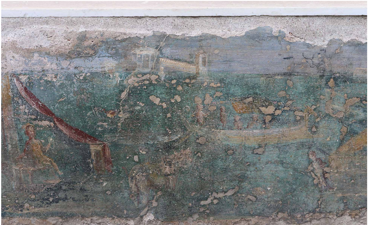
FIG. 5. Detail of the interior face of the eastern bench of the Casa dell'Efebo water triclinium (D. Zarzycki). Visible features include those labeled on print-published fig. 7 as A, C, D, E, and N.