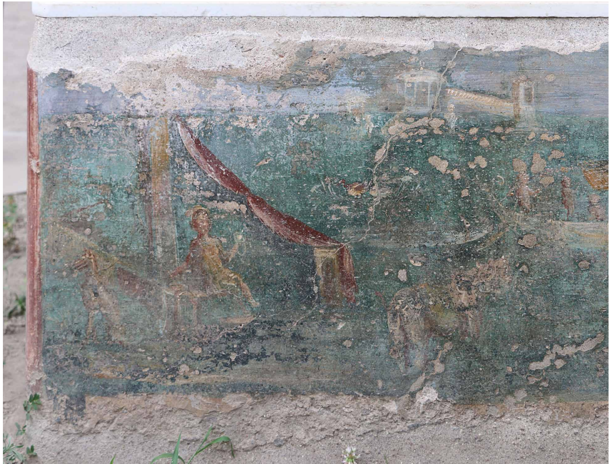
FIG. 4. Detail of the interior face of the eastern bench of the Casa dell'Efebo water triclinium (D. Zarzycki). Visible features include those labeled on print-published fig. 7 as A, B, C, D, and N; part of E is also visible.