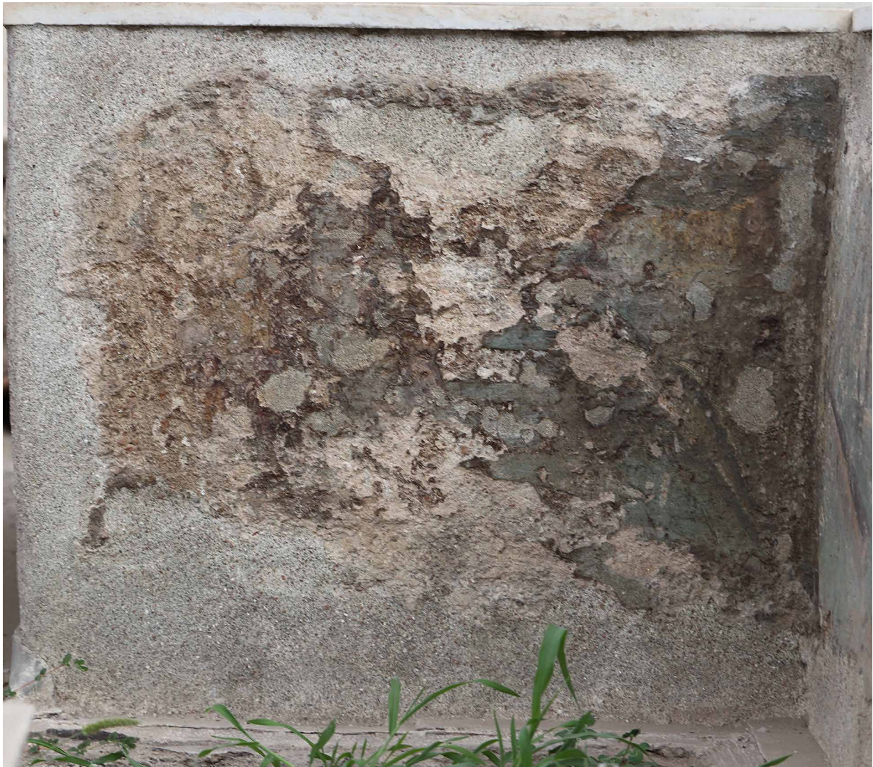
FIG. 11. Interior face of the western side of the southern bench of the Casa dell'Efebo water triclinium. Visible features include those labeled on print-published fig. 10, bottom, as A and B (both now partly destroyed).