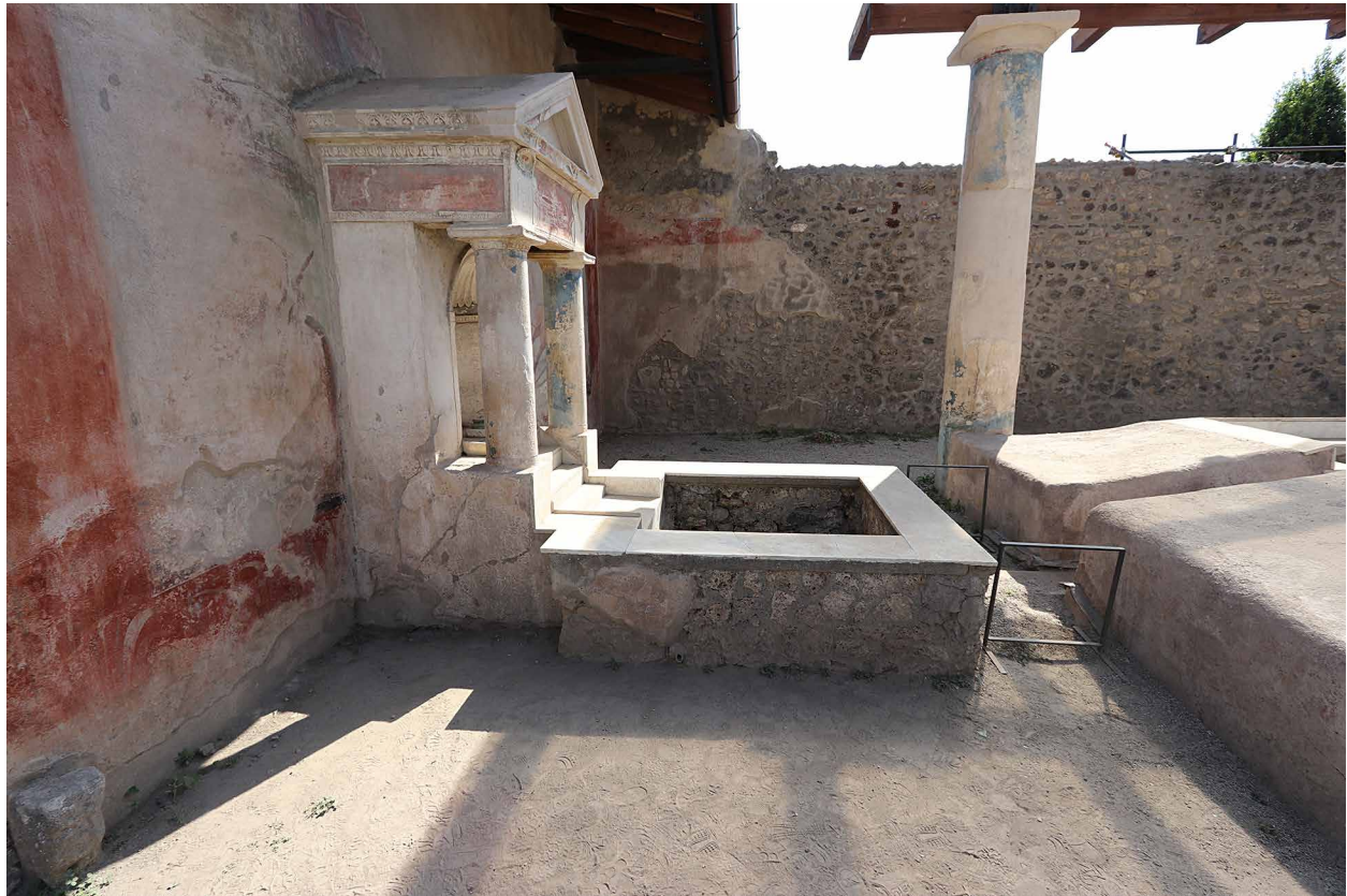
FIG. 1. Aedicular fountain, water basin, marble channel, and southern bench of the water triclinium in the Casa dell'Efebo, facing west.

Unless otherwise noted in the caption, images are by the author. Images are not edited by the AJA to the same level as those in the published article.