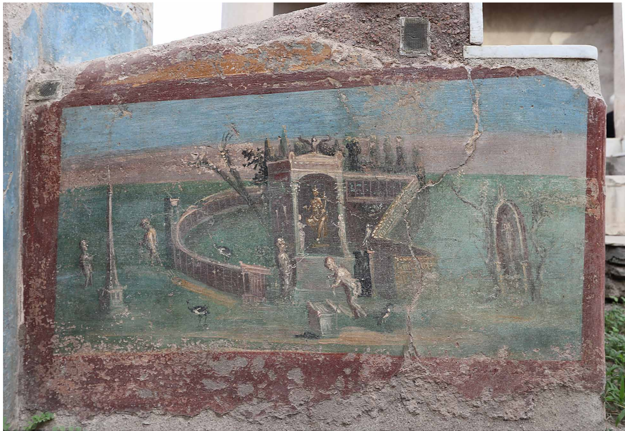
FIG. 2. North face of the eastern bench of the Casa dell'Efebo water triclinium. Visible features include all those labeled on fig. 6 in the print-published article.