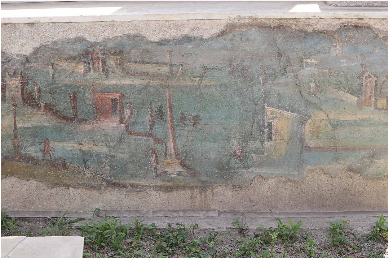
FIG. 17. Detail of the interior face of the western bench of the Casa dell'Efebo water triclinium. Visible features include those labeled on print-published fig. 11 as G, J, K, L, M, N, O, P, Q, R, and T.