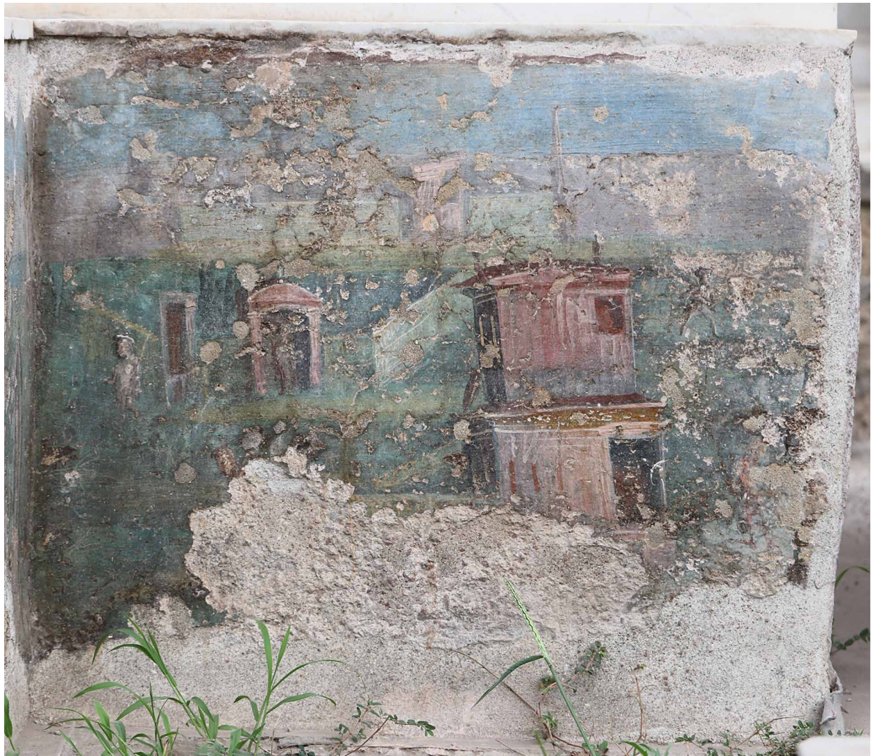
FIG. 10. Interior face of the eastern side of the southern bench of the Casa dell'Efebo water triclinium. Visible features include those labeled on print-published fig. 9, top, with the exception of the now mostly destroyed D and F.