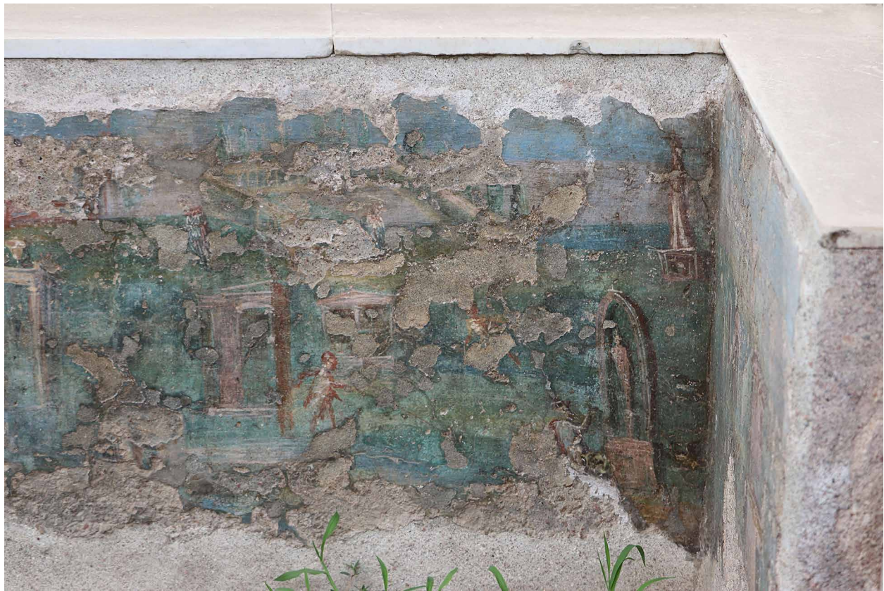
FIG. 9. Detail of the interior face of the eastern bench of the Casa dell'Efebo water triclinium (D. Zarzycki). Visible features include those labeled on print-published fig. 7 as H (now mostly destroyed) I, L, and M (partly destroyed), and in print-published fig. 9, top, as H.