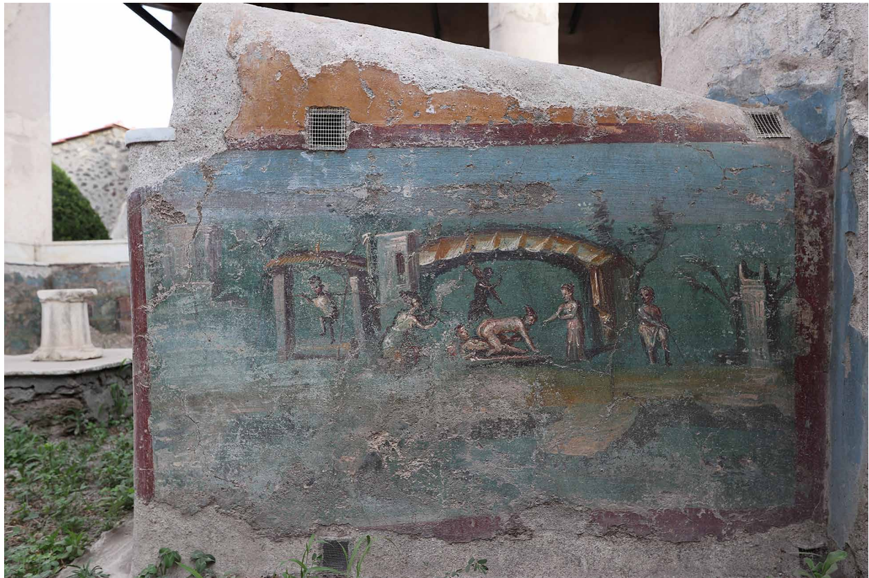
FIG. 19. Northern face of the western bench of the Casa dell'Efebo water triclinium. Visible features include those labeled on print-published fig. 13, top, with the exception of the now mostly destroyed I and J.