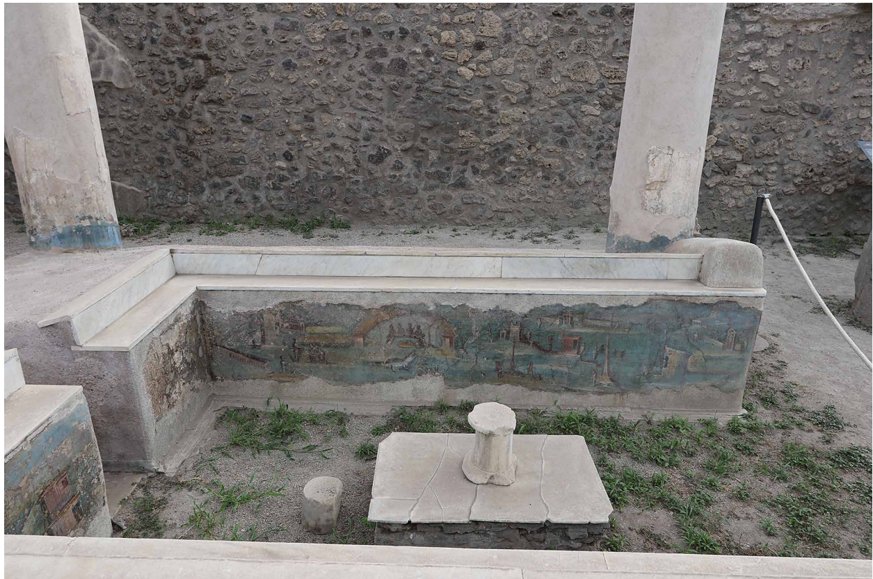
FIG. 12. View of the Casa dell'Efebo water triclinium, facing west, with view of the interior face of the western bench (D. Zarzycki).