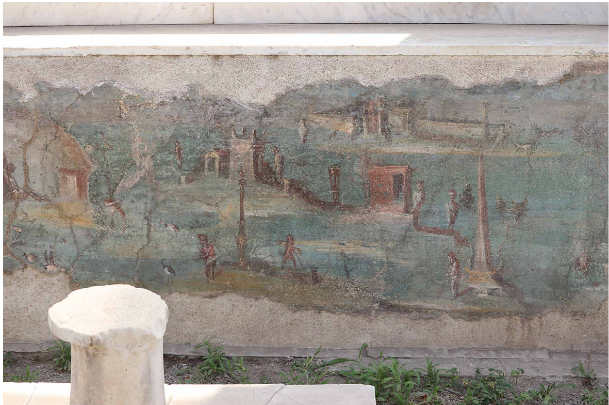
FIG. 16. Detail of the interior face of the western bench of the Casa dell'Efebo water triclinium. Visible features include those labeled on print-published fig. 11 as F, G, H, I, J, K, L, M, N, O, and V; part of D is also visible.