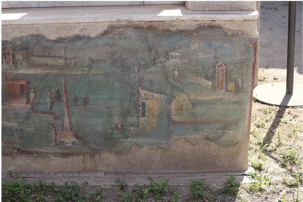
FIG. 18. Detail of the interior face of the western bench of the Casa dell'Efebo water triclinium. Visible features include those labeled on print-published fig. 11 as L, N, O, P, Q, R, S, and T.