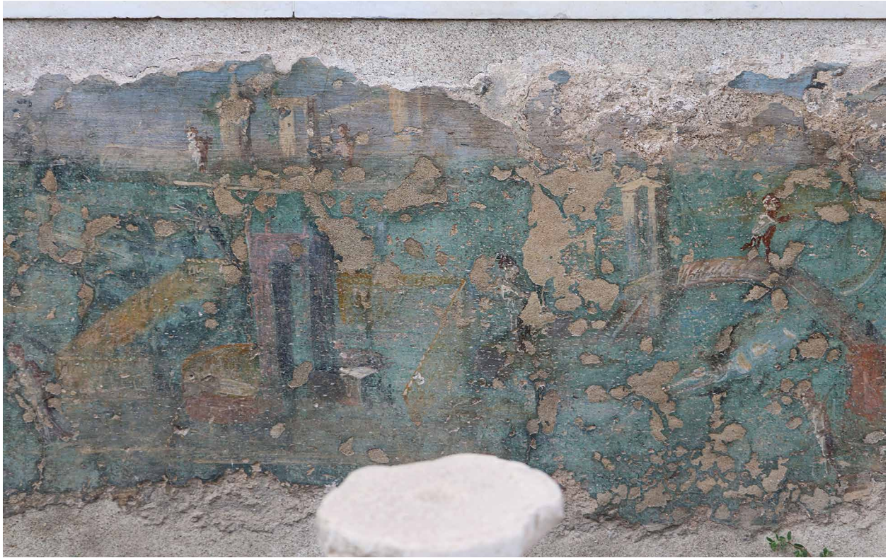
FIG. 7. Detail of the interior face of the eastern bench of the water triclinium, Casa dell'Efebo (D. Zarzycki). Visible features include those labeled on print-published fig. 7 as J, O, and F.