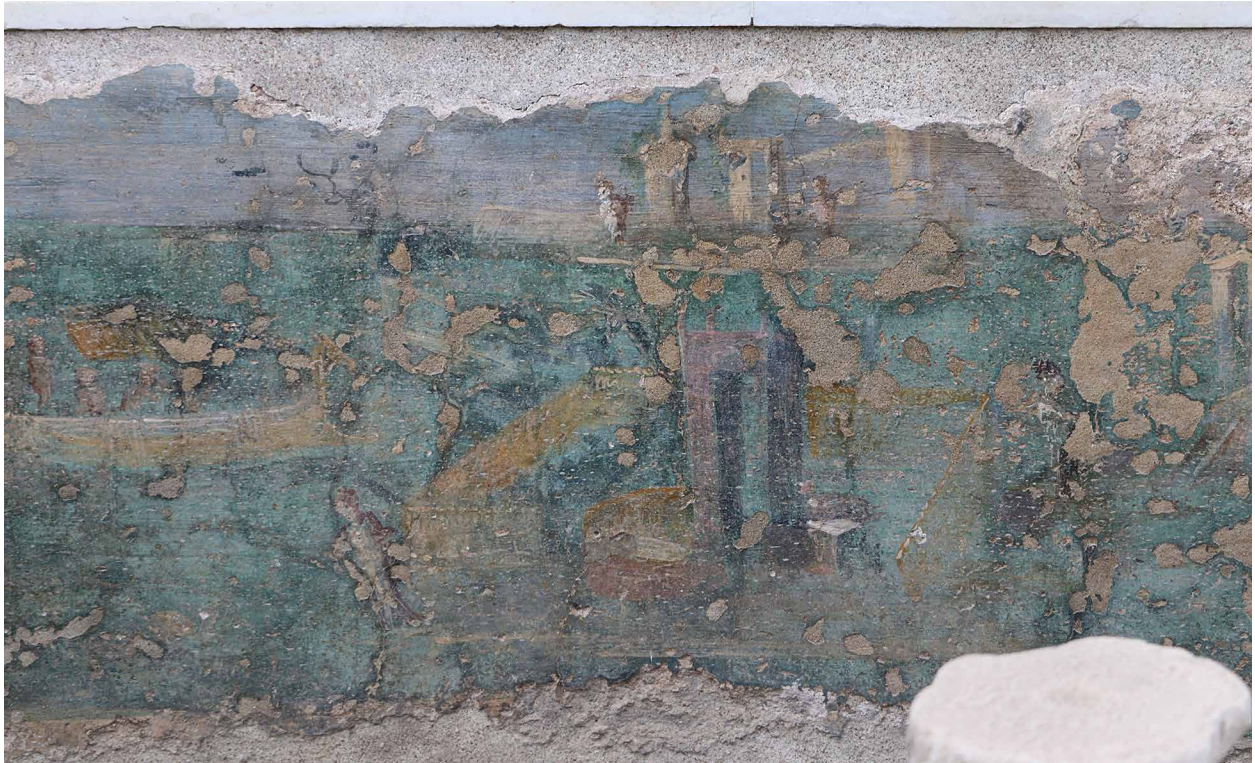
FIG. 6. Detail of the interior face of the eastern bench of the Casa dell'Efebo water triclinium (D. Zarzycki). Visible features include those labeled on print-published fig. 7 as J and O; part of E is also visible.