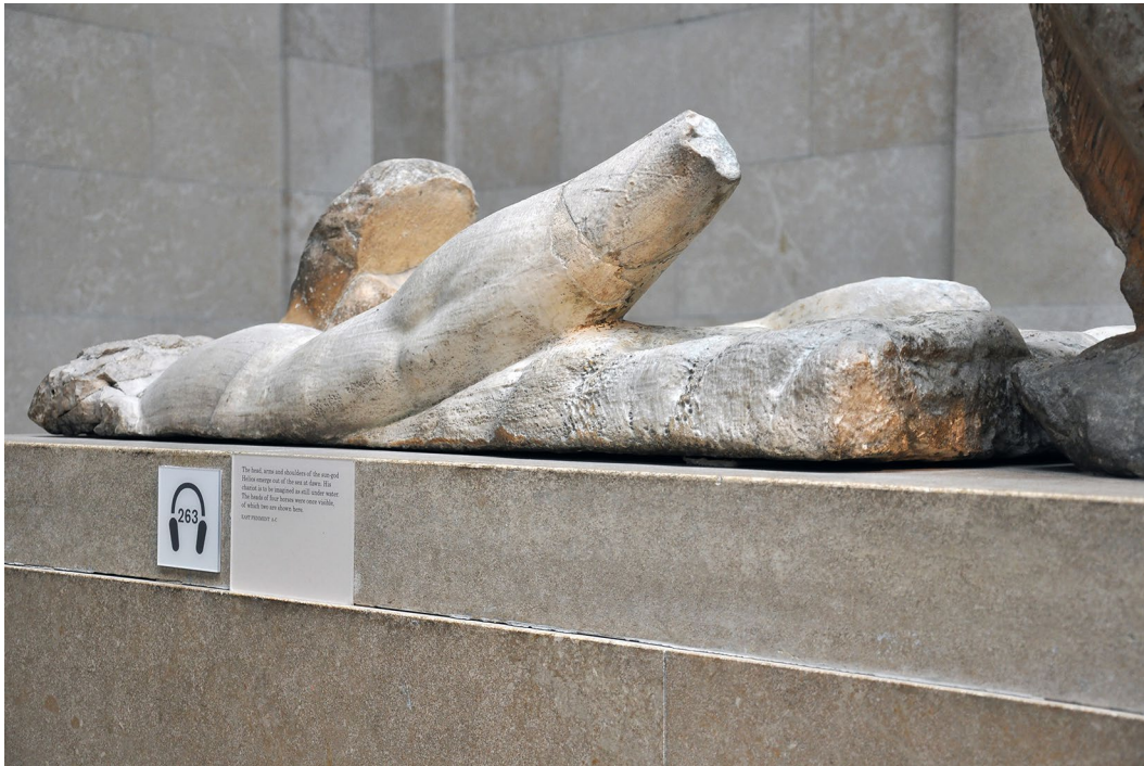
FIG. 11. Helios (east pediment A), detail showing modeled waves covering right side of Helios' torso, below right arm. London, British Museum.