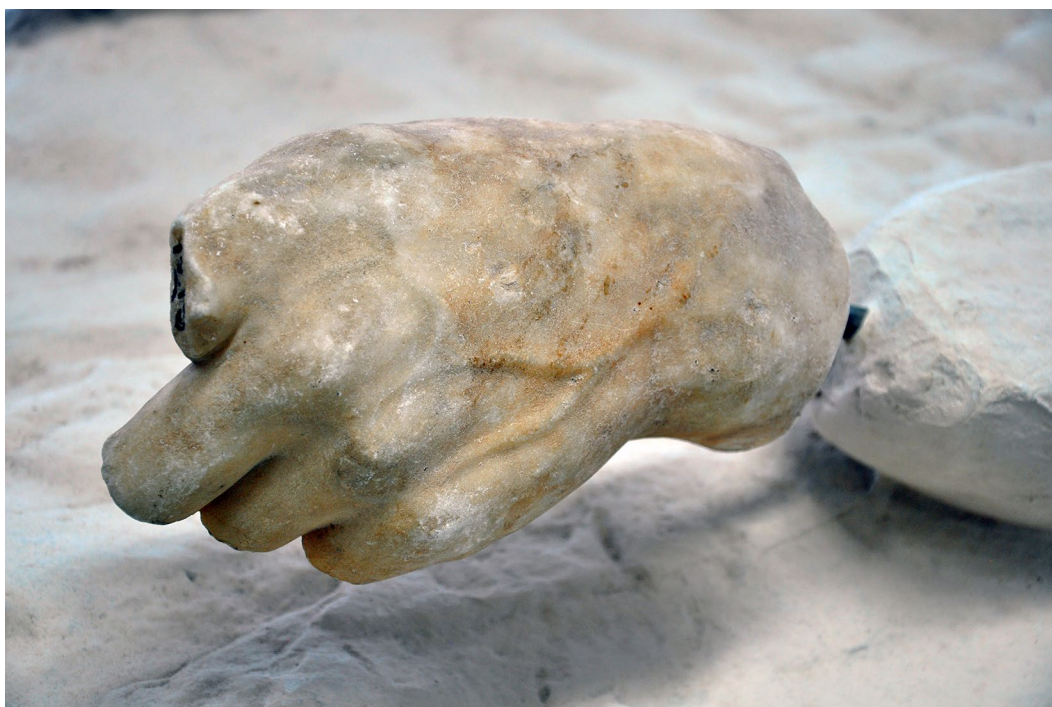
FIG. 8. Left hand of Helios (probably), Parthenon east pediment. Athens, Acropolis Museum, inv. no 1215.