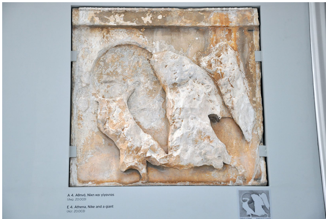
FIG. 7. Parthenon East Metope 4, showing Athena slaying a giant, with Nike hovering behind her. Athens, Acropolis Museum, inv. no. 20.003.