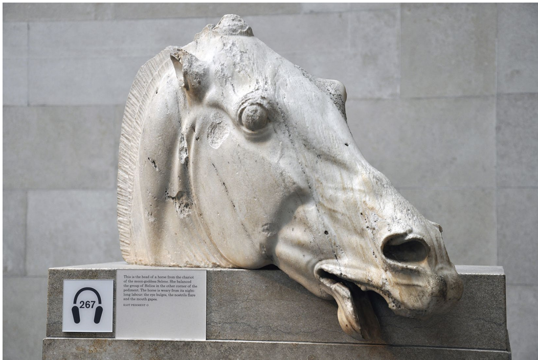
FIG. 3. Head of Selene's horse (Parthenon east pediment O). London, British Museum.