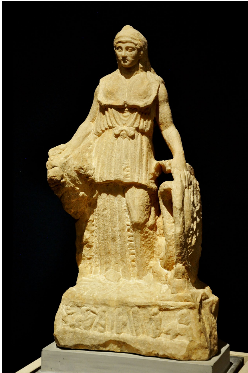
FIG. 1. The Lenormant Athena, unfinished, second/third century C.E. Athens, National Museum, inv. no. 128.

Unless otherwise noted in the caption, images are by the author. Images are not edited by the AJA to the same level as those in the published article.