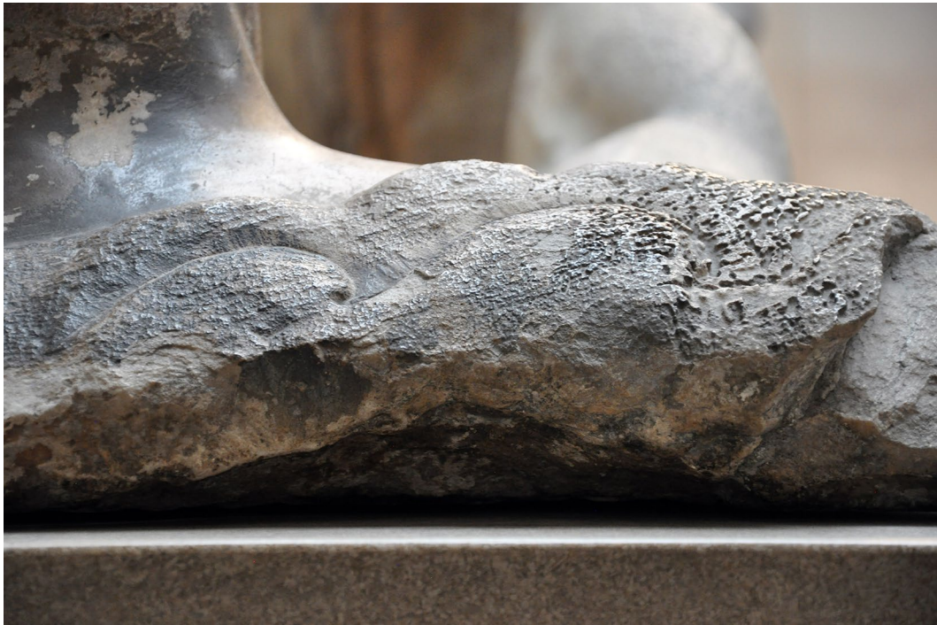
FIG. 9. Helios, from east pediment of Parthenon, rear view; detail of sea crests over right shoulder. London, British Museum.