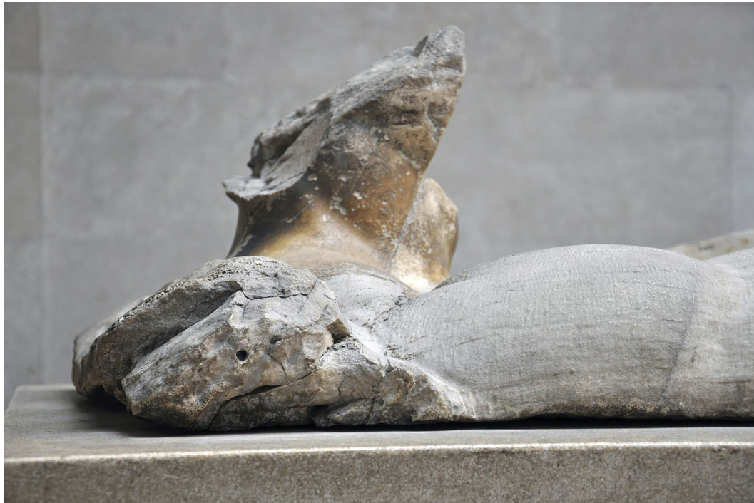
FIG. 5. East pediment A (Helios), detail. Hole for attachment of bronze object (a fish or dolphin?), on front edge of sea mass behind Helios' right shoulder. London, British Museum.