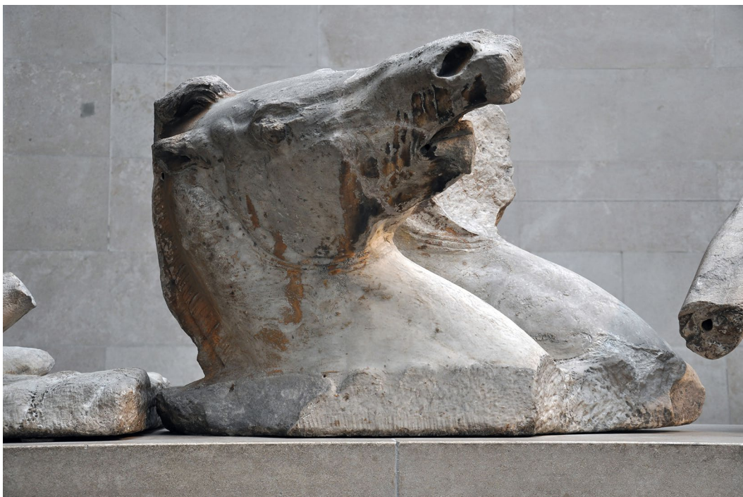
FIG. 12. Helios' outer trace horse (east pediment B), with waves chiseled flat on plinth. London, British Museum.