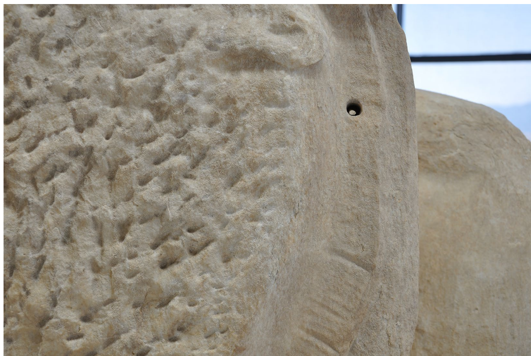
FIG. 4. East pediment C, detail of hole drilled through the mane of Helios' inner trace horse. Athens, Acropolis Museum.