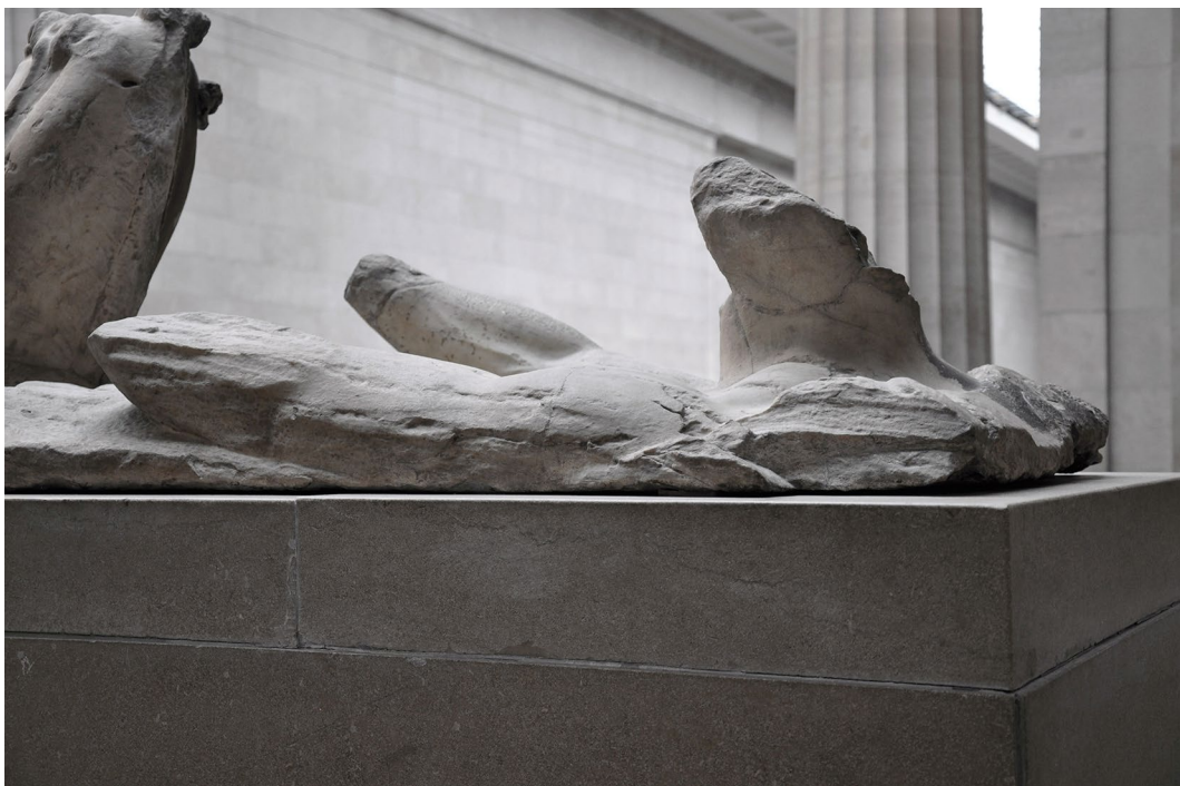
FIG. 10. Helios (east pediment A), left side. London, British Museum.