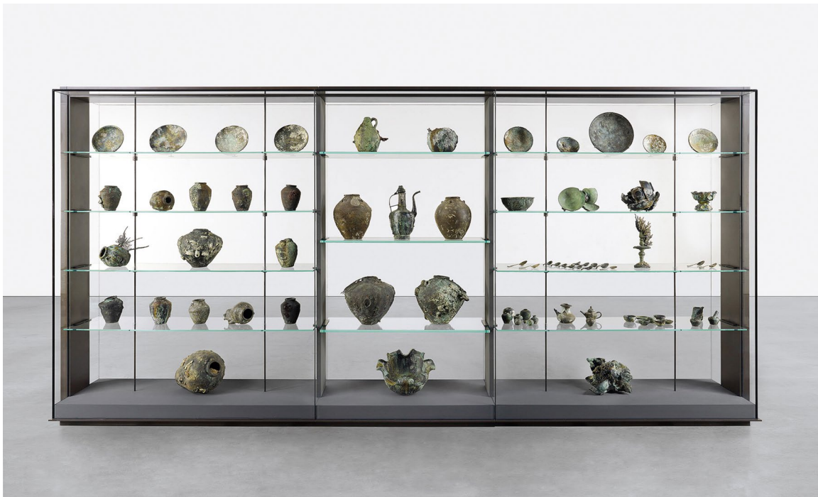
FIG. 4. Damien Hirst, A Collection of Vessels from the Wreck of the "Unbelievable".

above the sea; a longtime collaborator of Franck Goddio, Gerigk is well known in the archaeological community for his striking photographs of colossal statues from Alexandria's submerged harbor. But with such a lavish exhibition of engaging finds, it is hardly surprising that the artist prefers not to risk exhausting an audience with the tedium of proper archaeology. Professional archaeology could productively take note of the excitement generated not only by the site and its golden splendor but also by Hirst's juxtaposition of mysterious places and objects into an engaging and accessible story. This approach offers an opportunity for the public to interact with the past, a past that itself intersects with many other pasts, both fantastic and real. Yet the contrast between these nods at idealized scientific practice and the portrayal and discourse on "salvage" is jarring. In another catalogue essay ("Discovering a Shipwreck"), Goddio, apparently responsible for the operation that relocated the Apistos , notes that scientific approaches do not preclude emotional ones despite the laborious research, geophysical detection, and complex excavation involved