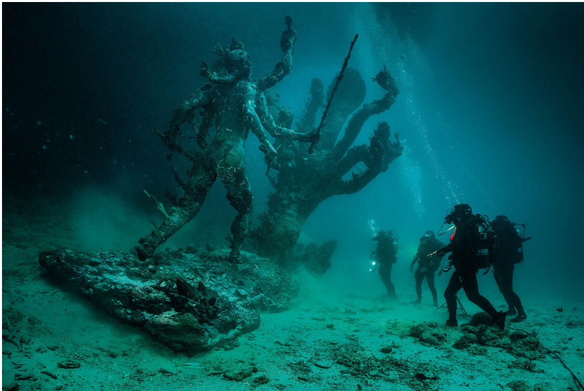
FIG. 5. Damien Hirst, Hydra and Kali Discovered by Four Divers (C. Gerigk; © Damien Hirst and Science Ltd. All rights reserved, DACS/ARS 2017).

for precisely such personal avarice. The unflattering but glaringly obvious comparison for Amotan is offered unapologetically by Loyrette: Petronius' Trimalchio, another wealthy freedman whose garish excesses make him a caricature of the nouveau riche. It is clearly impossible to separate Amotan and Hirst with their conspicuous consumption, fetishization, and conscious rejection of elite norms; Bust of the Collector looks remarkably like Hirst as a heroically nude but otherwise rather traditional republican statesman. 18 The obsessive zeal they share is summed up nicely by Schama's description of Amotan: "Brought to light now, his bloated excesses, his feverish passion to acquire, his pornographic ecstasy in the writhing of serpents and the torment of mortals—all seem pretty much in tune with the tastes of our time, do they not?" 19 Barely