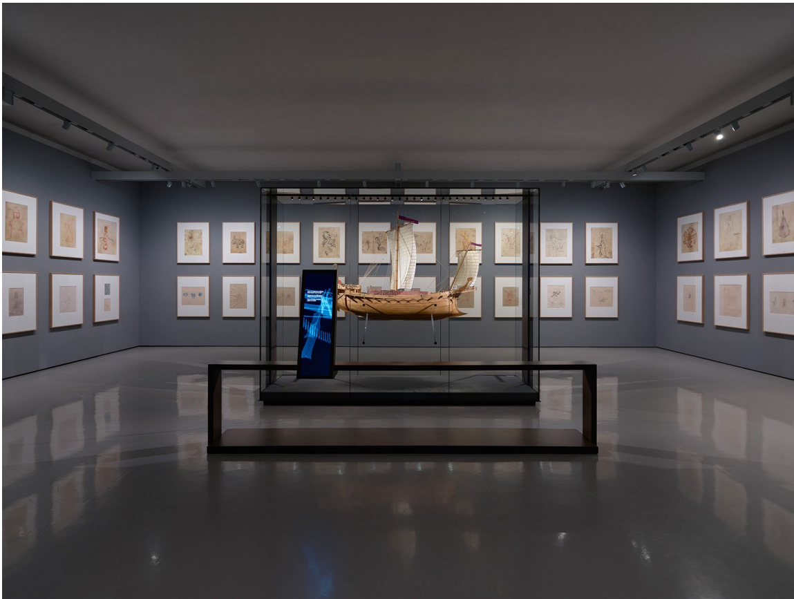
FIG. 1. Damien Hirst, Scale Model of the "Unbelievable" with Suggested Cargo Locations , surrounded by a selection of 44 drawings (Prudence Cumming Associates; © Damien Hirst and Science Ltd. All rights reserved, DACS/ARS 2017).

The overwhelming cargo fills 5,000 m 2 in two historic venues run by the collector François Pinault in Venice, a city where collections of displaced treasure have long found a new home. Although the Punta della Dogana (old customs house) is perhaps the thematically obvious point of entry for a journey and the first in the catalogue, Palazzo Grassi offers a better initial glimpse into the archaeological backstory. Here, the visitor's plunge into spectacle meets an 18 m resin statue, Demon with a Bowl , 10 painted to look like bronze with attached shells and coral growths. The colossal headless nude fills the atrium of the palazzo. Before viewing the label, one wonders whether the figure represents Poseidon or Zeus (it