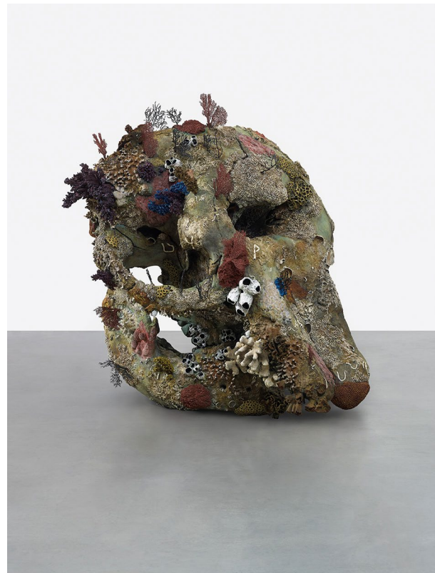
FIG. 3. Damien Hirst, Skull of a Cyclops (Prudence Cuming Associates; © Damien Hirst and Science Ltd. All rights reserved, DACS/ARS 2017).

The colors, lighting, coral, and fish match the objects in their beauty and color, and viewers marvel at photographs of divers on the seabed kneeling as if in prayer before Buddhas and sphinxes surrounded by coral. In one sector of the site, the seabed is strewn with gold: a jumble of coins, jewelry, a massive temple door, and a sculpture of the severed head of Medusa waiting to turn viewers into gold rather than stone. 15 Most often,