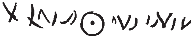
FIG. 1. CIL 4 10554b (cat. no. 5 in the AJA print-published article) (courtesy Berlin-Brandenburgische Akademie der Wissenschaften).

Unless otherwise noted in the caption, images are by the author. Images are not edited by the AJA to the same level as those in the published article.