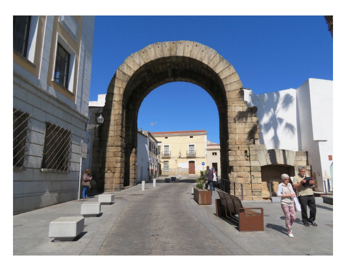
FIG. 1. Southeastern facade of the remains of the triple-bay arch at Mérida, Spain, with a view of the central archway and one lateral archway, constructed in the early first century C.E.

Unless otherwise noted in the caption, images are by the author. Images are not edited by the AJA to the same level as those in the published article.