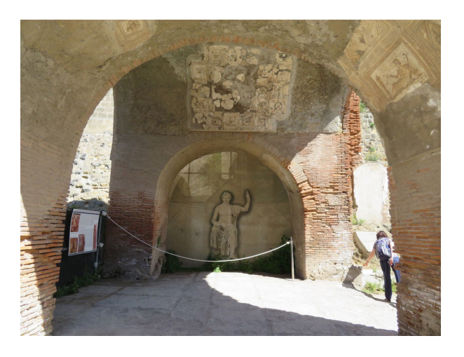
FIG. 5. View of the southwestern facade of the tetrapylon, with decoration visible under the archivolt and barrel vault, Herculaneum, Italy, constructed in the mid first century C.E.