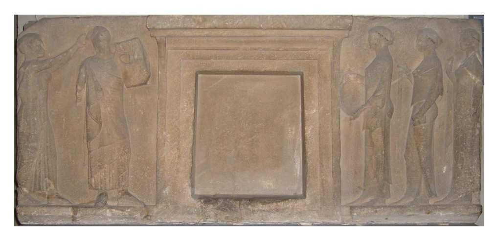
FIG. 8. Relief of Apollo and Nymphs, with an offering niche, northwest wall of the Passage des Théores, Thasos, Greece, sculpted ca. 480 B.C.E.