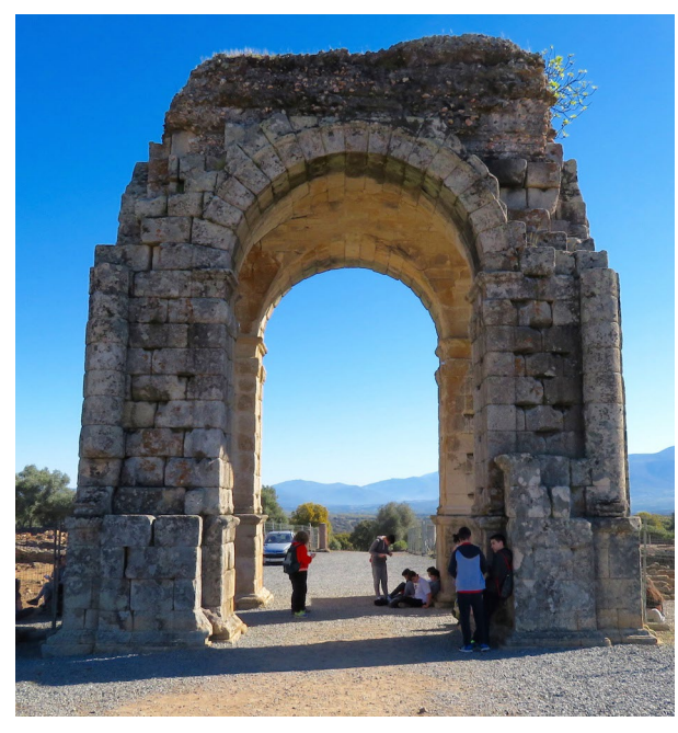
FIG. 3. Southwestern facade of the tetrapylon at Cáparra, Spain, constructed in the late first century C.E.