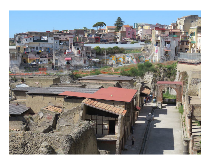
FIG. 4. View from the southeast of the tetrapylon on the Decumanus Maximus, Herculaneum, Italy, constructed in the mid first century C.E.