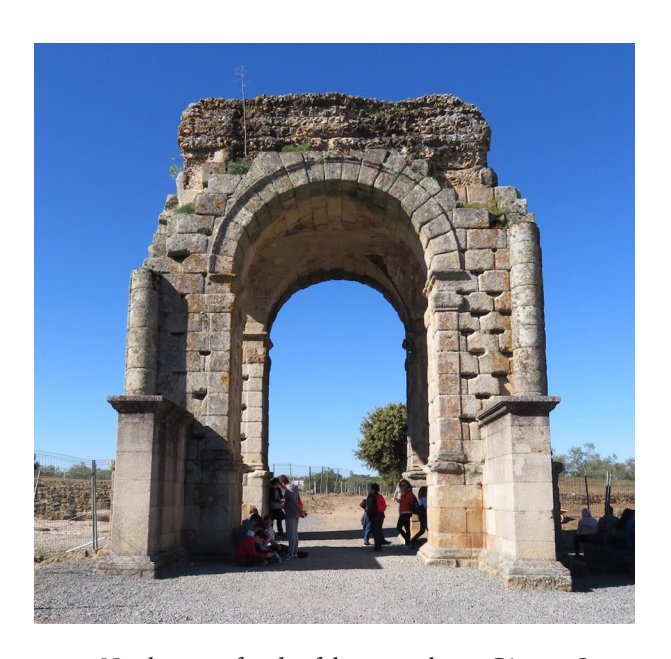
FIG. 2. Northeastern facade of the tetrapylon at Cáparra, Spain, constructed in the late first century C.E.