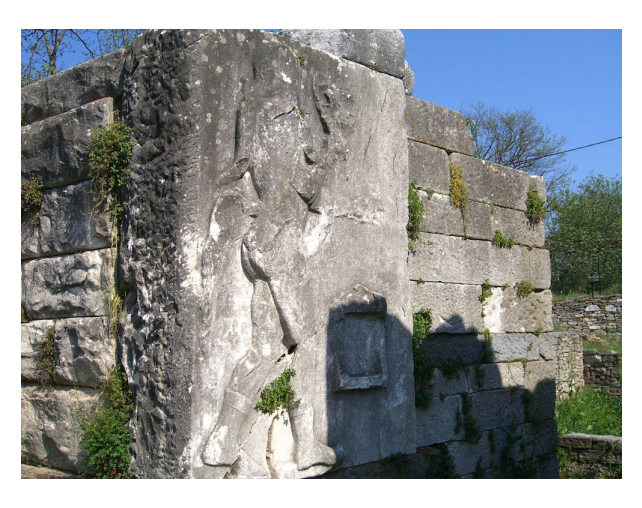
{\tt FIG.~7}. Relief of Silenus, Gate of Silenus, Thasos, Greece, constructed ca. 500 B.C.E.