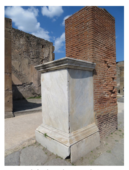
FIG. 6. Arch for the Holconii, northwestern pier with an oblique view of the statue pedestal dedicated to Marcus Holconius Rufus, Pompeii, Italy, first century C.E.