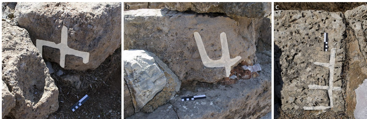
FIG. 4. Cut trident marks on a , Block 44; b , Block 40; c , Block 50 . The marks are highlighted in white.