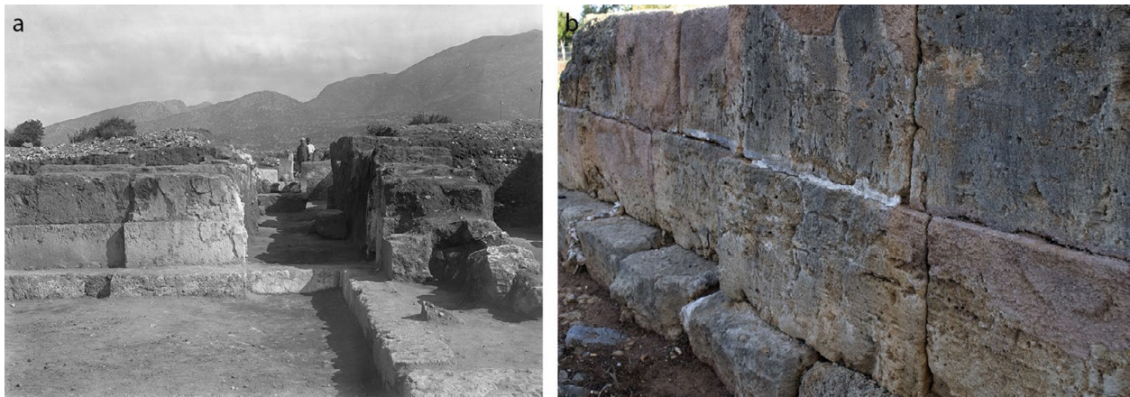
FIG. 1. Remains of plaster coating on the sandstone facade on the West Court: a , west facade of Rooms III 5 and I 7 during the excavations of the palace at the beginning of the 20th century, looking east (Pelon 1980, pl. 8.1; courtesy École française d'Athènes); b , view of plaster coating still preserved in the joints of the sandstone facade south of the West Wing (south wall of Room XX 2, looking northwest).

Unless otherwise noted in the caption, images are by the author. Images are not edited by the AJA to the same level as those in the published article.