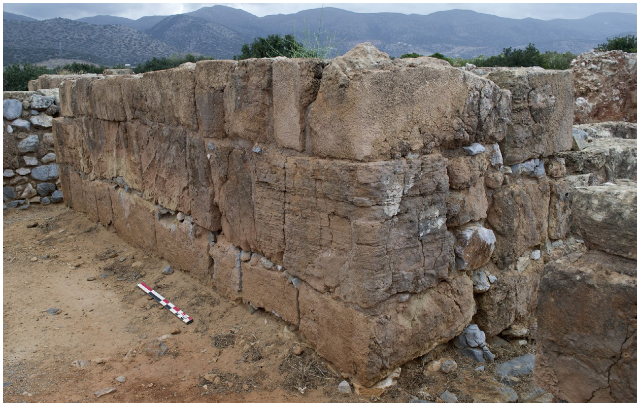
FIG. 6. Elaborate sandstone ashlar masonry in Area VII (west wall of Room VII 6, looking southwest), showing the careful positioning of the blocks.