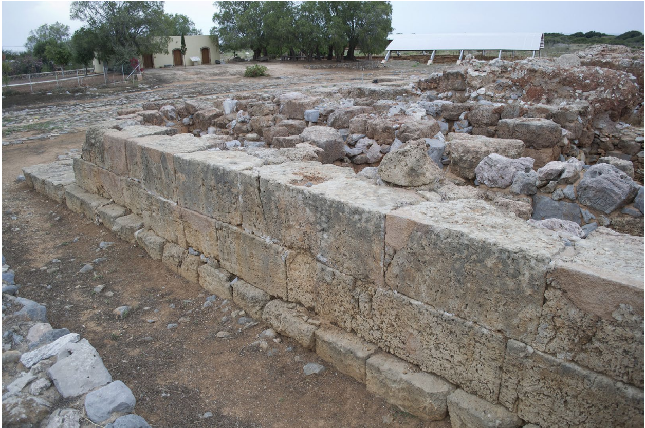
FIG. 3. South wall of Room XX 2, looking northwest.