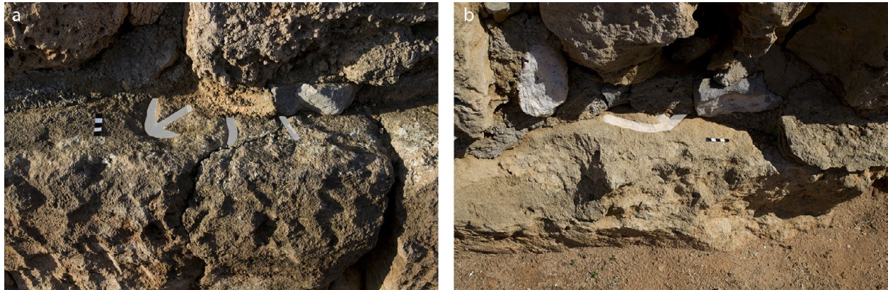
FIG. 5. Partly hidden masons' marks: a , on Block 35 in the north wall of Room I 6; b , on Block 38 in the south wall of Room I 5. The marks are highlighted in white.