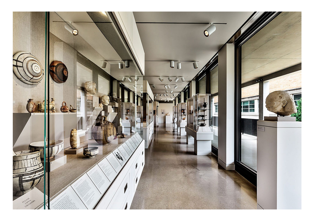
FIG. 1. View of the first floor galleries of the Upjohn Wing of the Kelsey Museum. Note the drawers with additional materials installed below the vitrines (courtesy HBRA Architects Inc. and M. Ballogg, Ballogg Photography).

Images are not edited by the AJA to the same level as those in the published article.