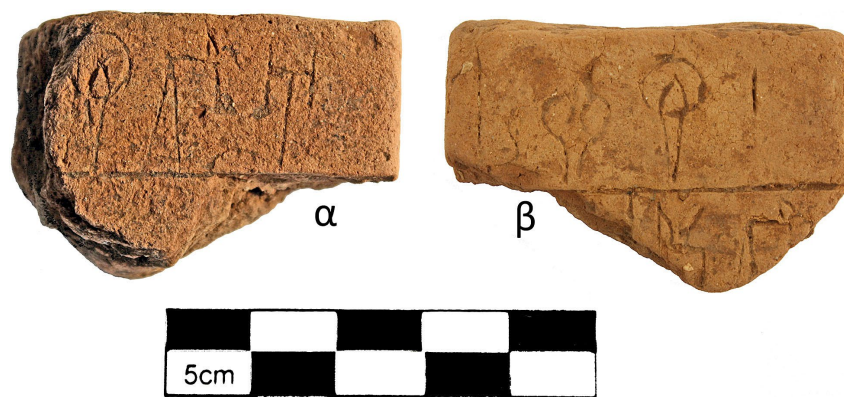
FIG. 6. The Linear B tablet from Iklaina (IK X 1).