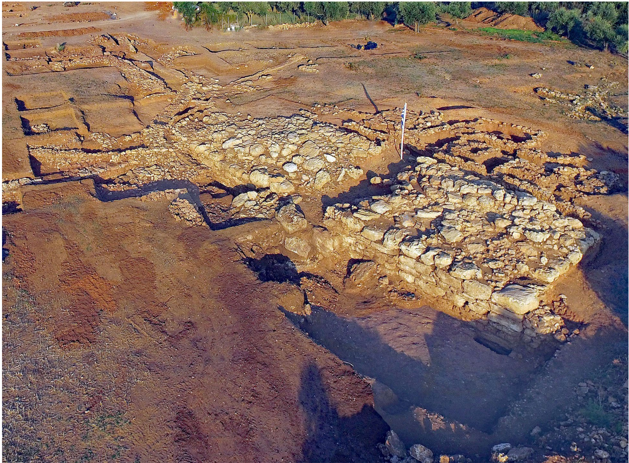
FIG. 7. Aerial view of the Cyclopean Platform from the northwest.