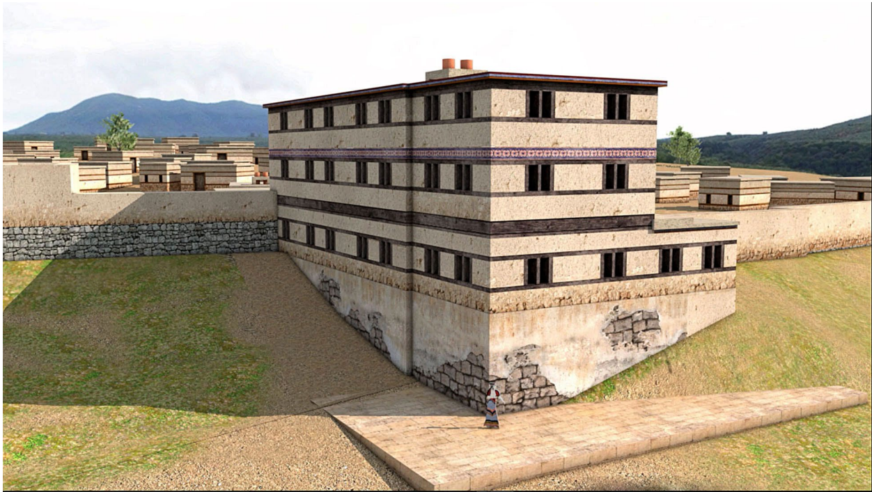
FIG. 10. Computer reconstruction of the Cyclopean Terrace Building (CTB). View from the northwest (reconstruction by D. Tsalkanis).