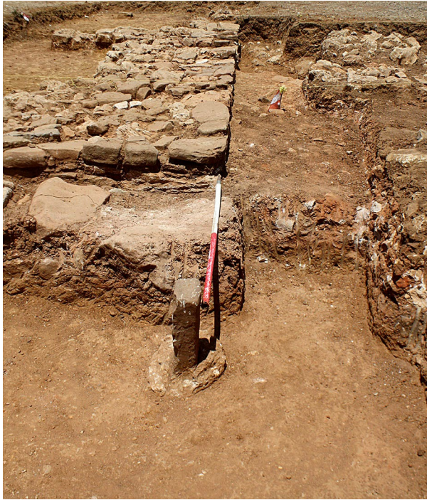
FIG. 12. View of the horos stone in relation to the east wall of Building X. View from the south.