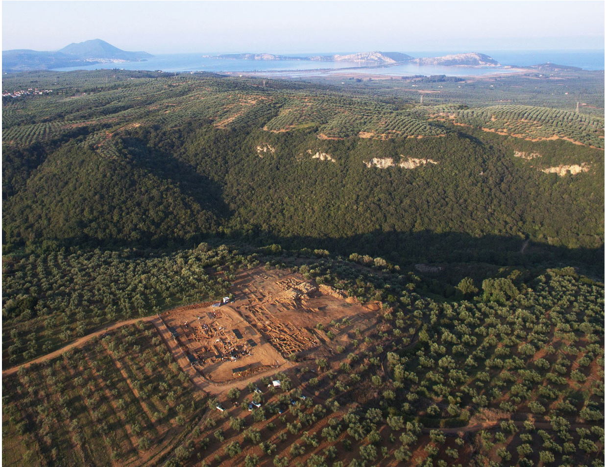
FIG. 1. Aerial view of the Iklaina plateau looking west. The bay of Navarino can be seen in the distance.

Images are not edited by the AJA to the same level as those in the published article.