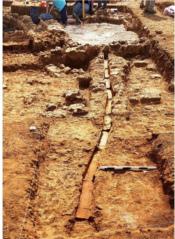
FIG. 13. Phase 4 plaster floor with clay channel west of Unit E. View from the west.