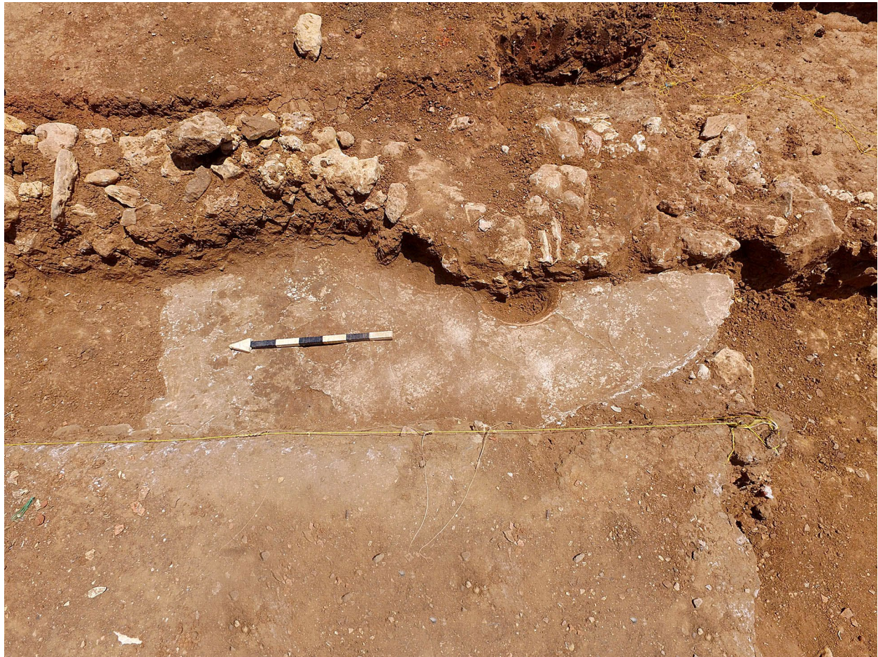
FIG. 14. Another phase 4 plaster floor west of Unit E. View from the west.