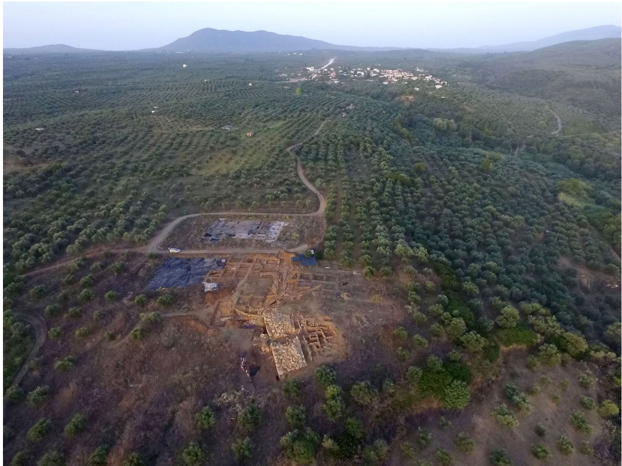
FIG. 2. Aerial view of the Iklaina plateau looking east. The modern village of Iklaina can be seen in the distance.