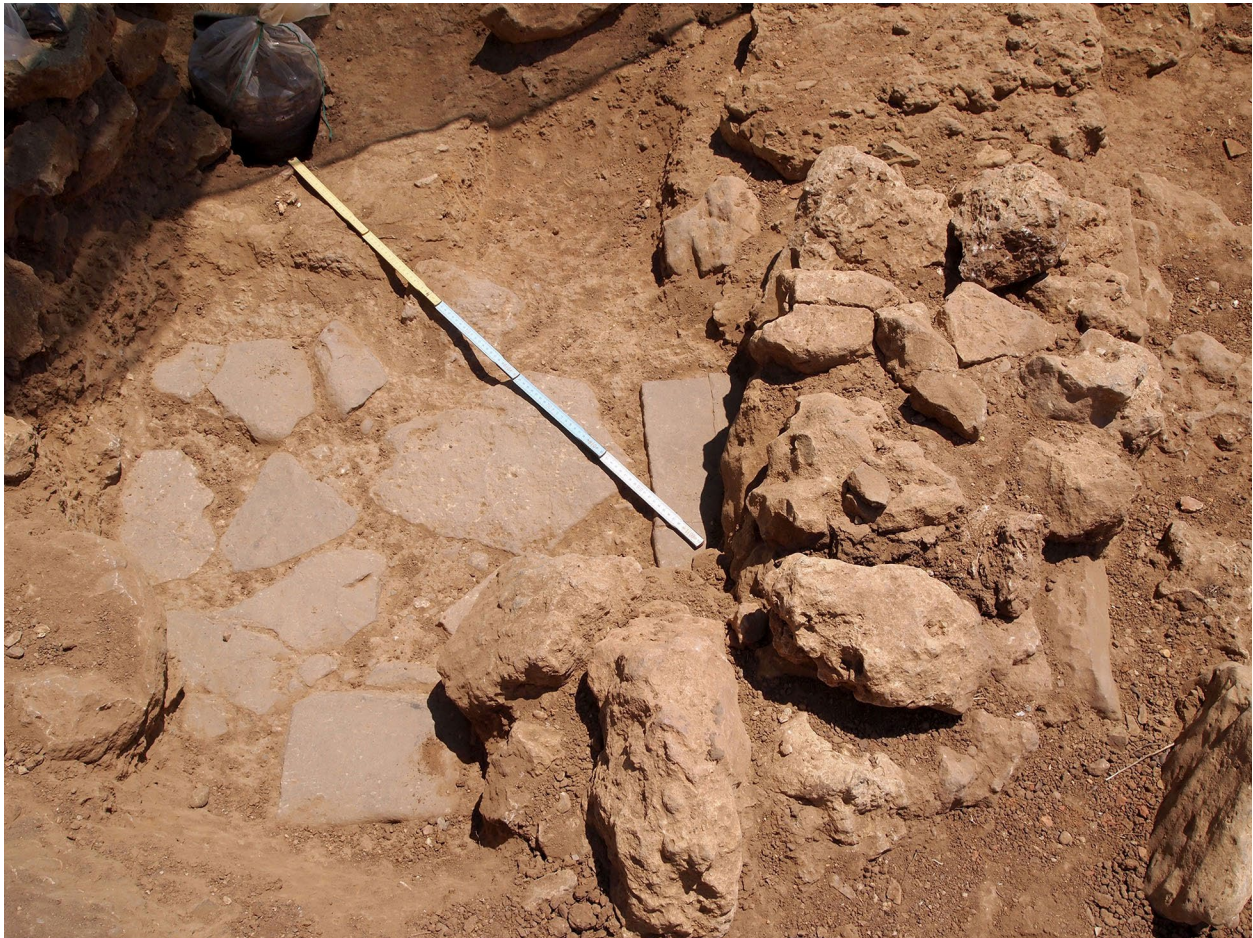
FIG. 5. Part of the LH II pavement in front of Terrace V. View from the south.