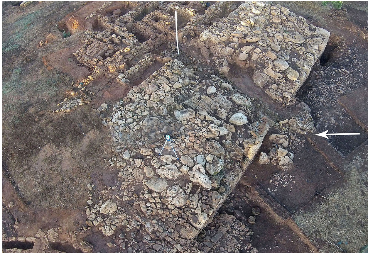
FIG. 8. Aerial view of the Cyclopean Platform from the east. The white arrow points to blocks displaced by bulldozer.