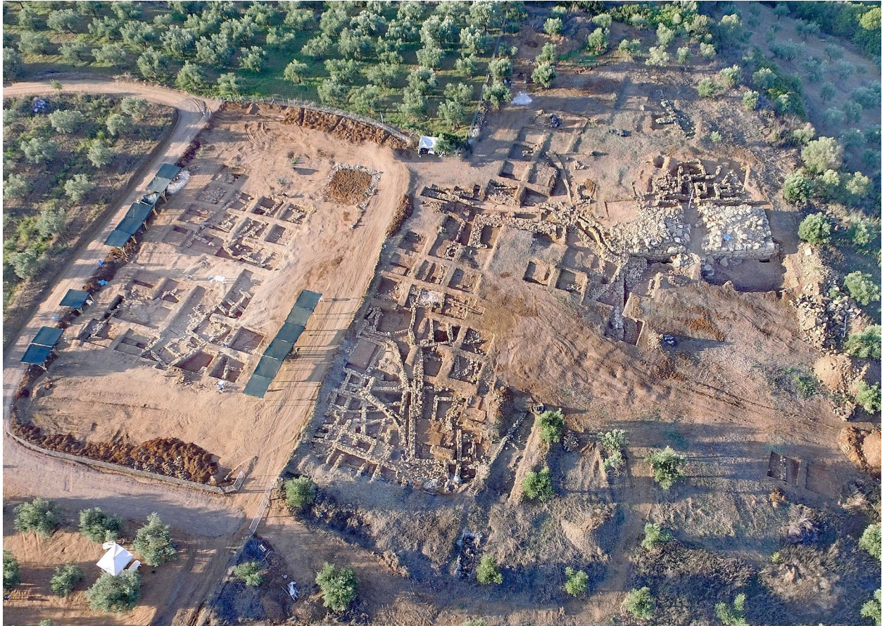
FIG. 3. Aerial view of the Ikaina site from the north.