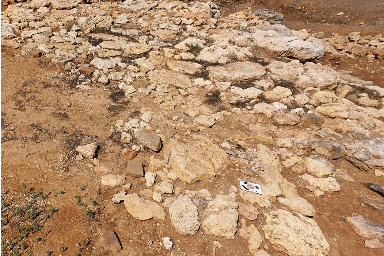
FIG. 11. Flagstones at the east end of the Cyclopean Platform marking the level of the floor of the Cyclopean Terrace Building (CTB).