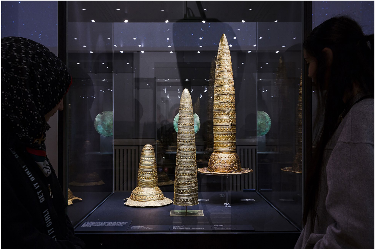
FIG. 5. Three gold hats (Berlin Gold Hat and the finds from Avanton and Schifferstadt), 1300–1000 B.C.E., in the last gallery of the exhibition, on “Space and Time”.