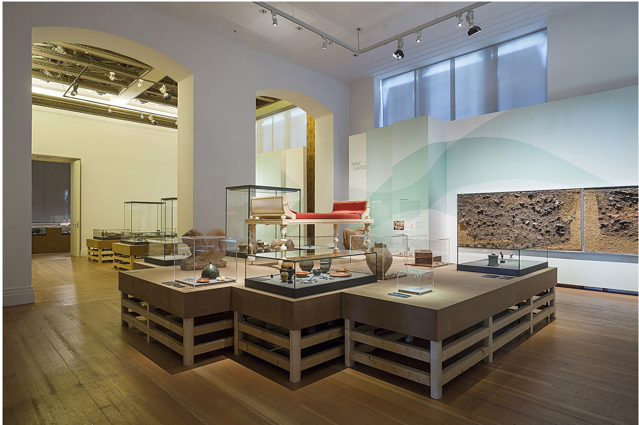
FIG. 4. View of “Transfer of Ideas and Spiritual Exchange” gallery. In the center, reconstruction of a Roman kline from a grave in a cemetery of a legionary camp in Haltern am See, first century C.E. (D. von Becker; © Staatliche Museen zu Berlin, Museum für Vor- und Frühgeschichte).