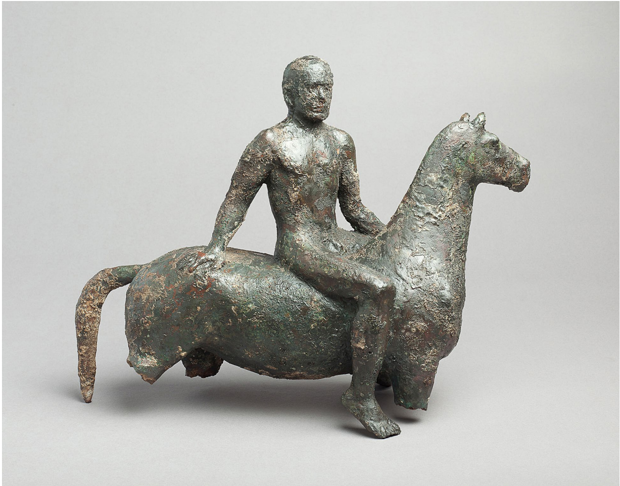
FIG. 2. Fritz Wrampe, equestrian statuette, bronze, 1933/34, ht. 44 cm; 1937 confiscated from Städtischer Kunsthalle Mannheim; ca. 1939 in commission of Kunsthandlung Karl Buchholz; since 2011 part of the Berlin sculpture find and currently kept in the Museum for Pre- and Early History in Berlin (A. Kleuker; © Staatliche Museen zu Berlin, Museum für Vor- und Frühgeschichte).