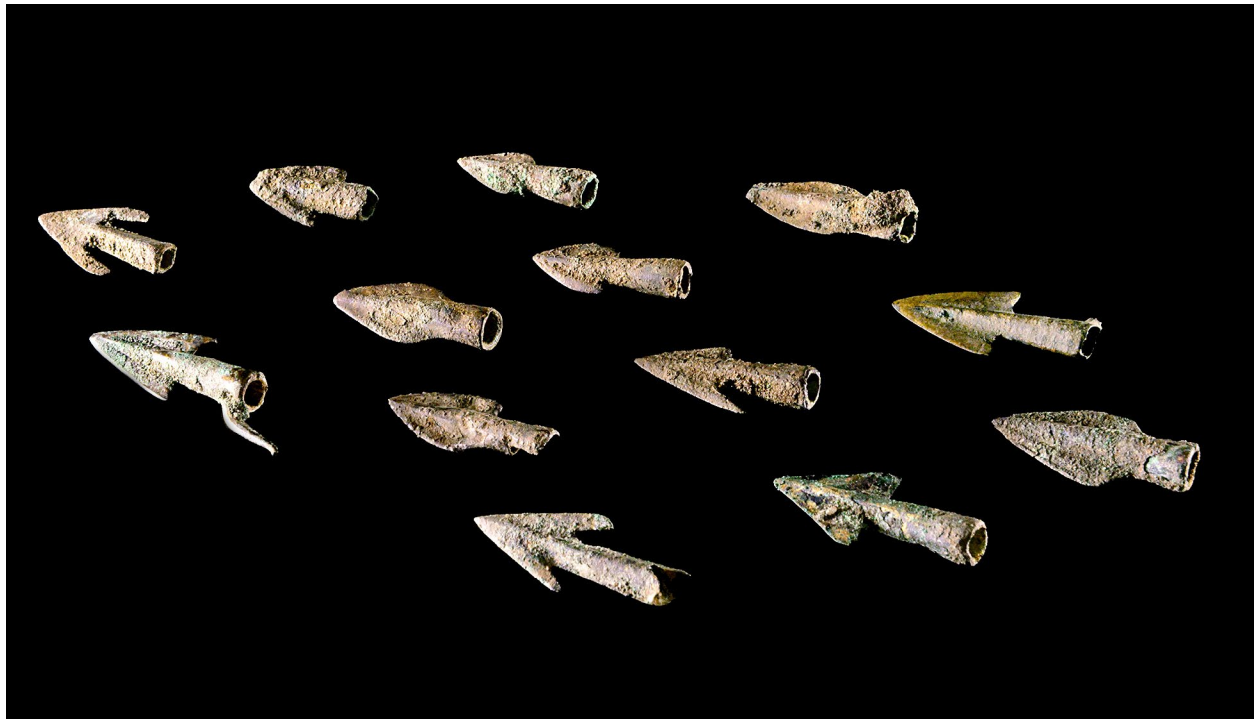
FIG. 1. Arrowheads from the Bronze Age battlefield at the Tollense valley, bronze, 13th century B.C.E.

Images are not edited by the AJA to the same level as those in the published article.