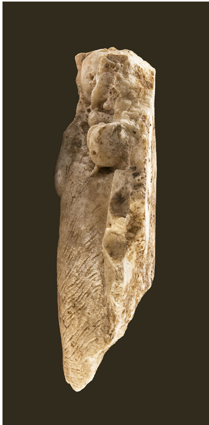
FIG. 4. Relief fragment with a griffin head from the Forum Portico, right side. Consorcio de la Ciudad Monumental de Mérida, inv. no. 12020/372/1 (C. López).