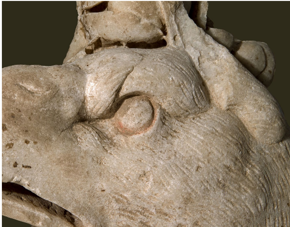
FIG. 5. Relief fragment with a griffin head, detail of eye (C. López).