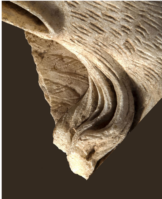
FIG. 7. Relief fragment with a griffin head, detail of beard and wing feathers (C. López).