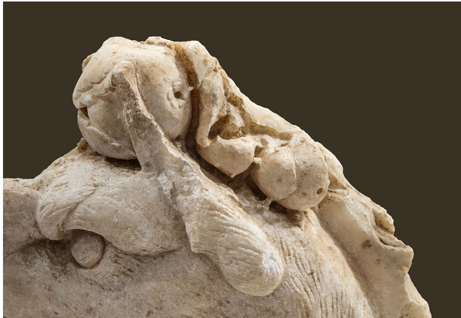
FIG. 6. Relief fragment with a griffin head, detail of pieces of fruit above the head (C. López).