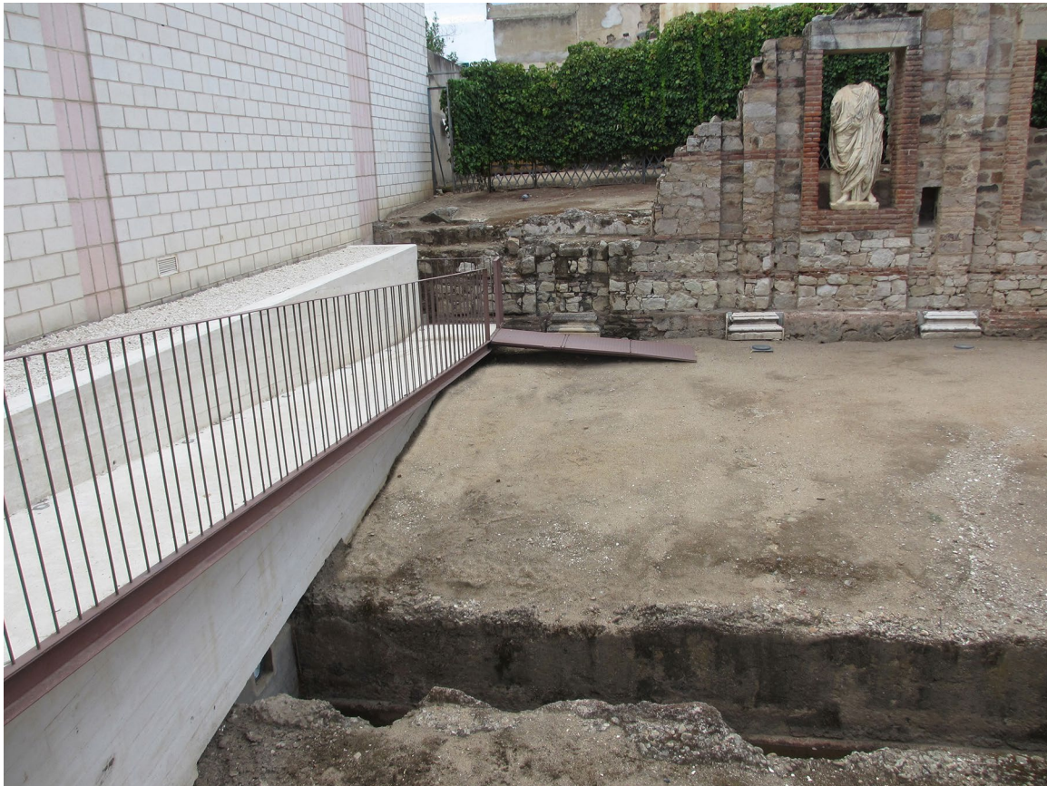
FIG. 1. Architectural structures open to the public in the Forum Portico (Mérida, Spain), with modern ramp.

Images are not edited by the AJA to the same level as those in the published article.