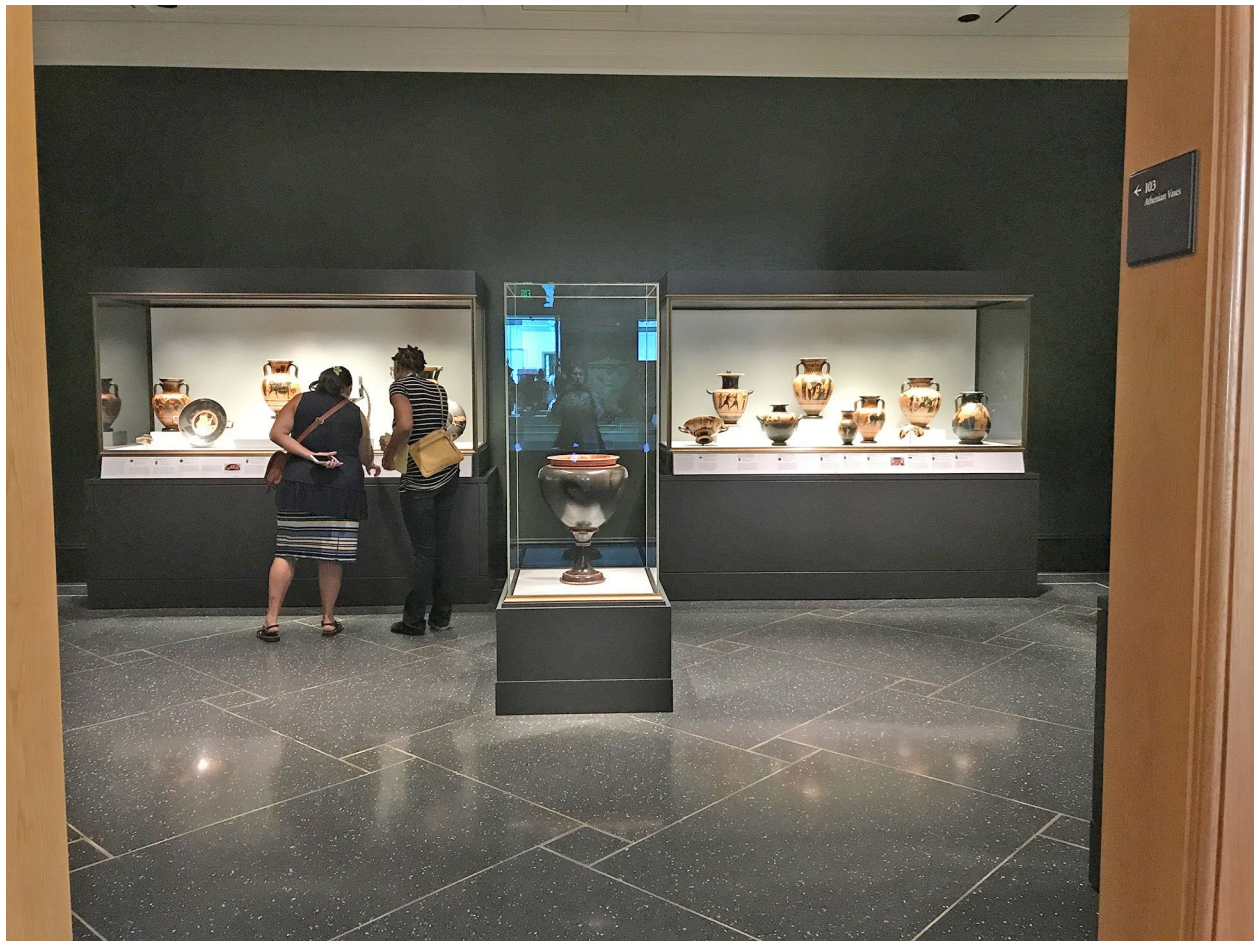
FIG. 2. View into the Athenian vases gallery on the ground floor of the Getty Villa.