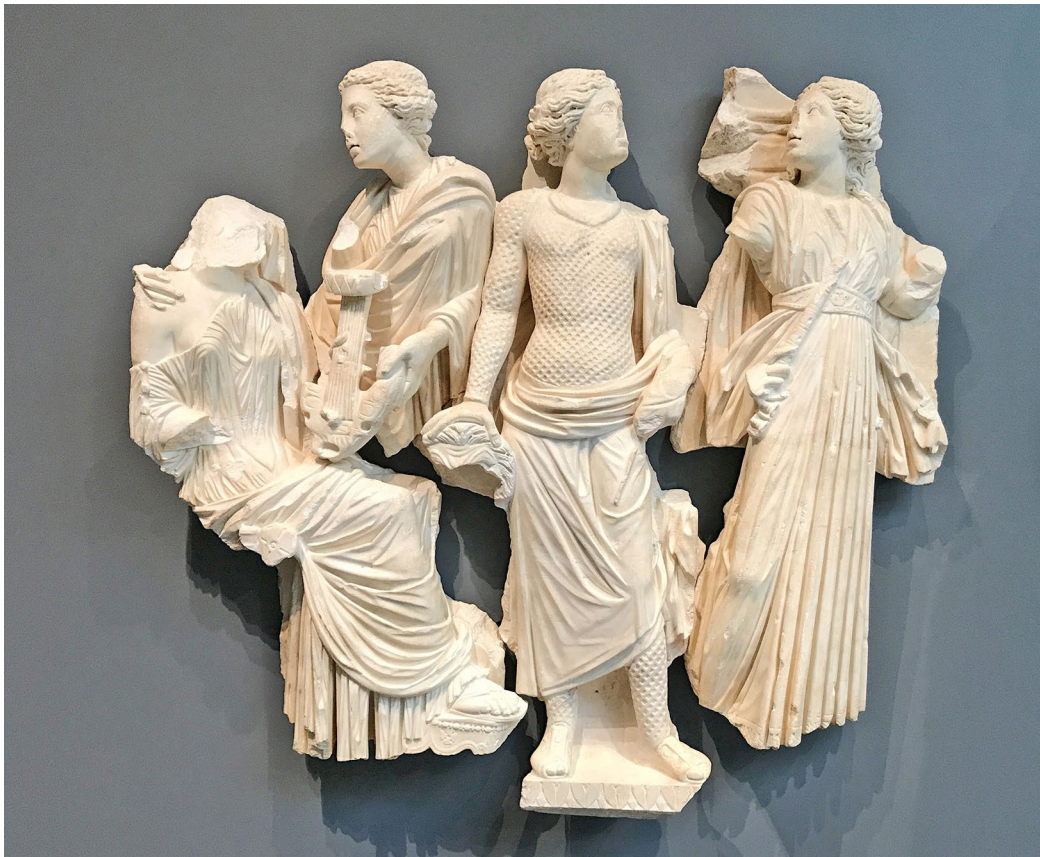
FIG. 3. Four muses from a Muse sarcophagus (J. Paul Getty Museum, inv. nos. 72.AA.90.1–4).