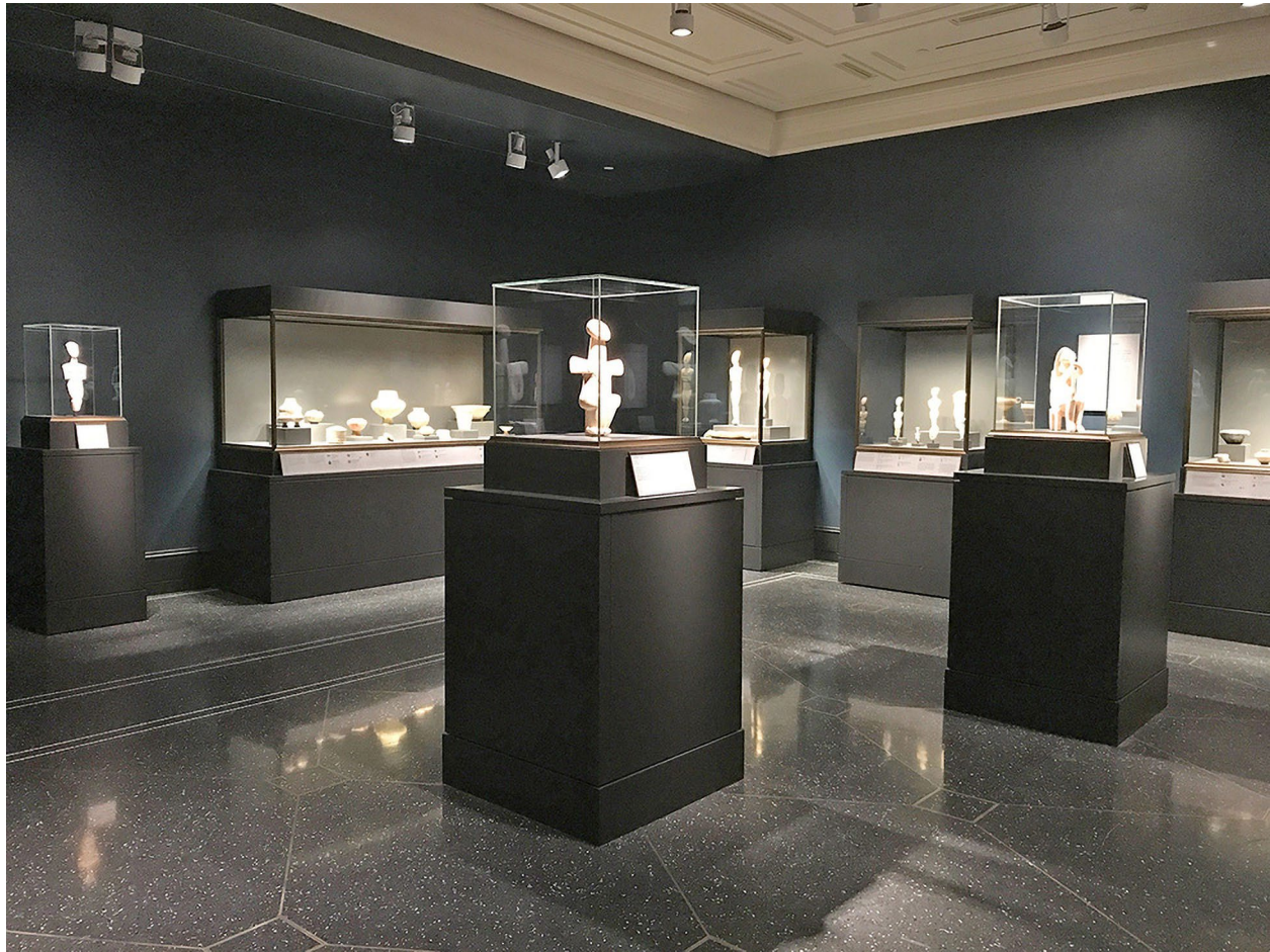
FIG. 4. Cycladic gallery on the ground floor of the Getty Villa.