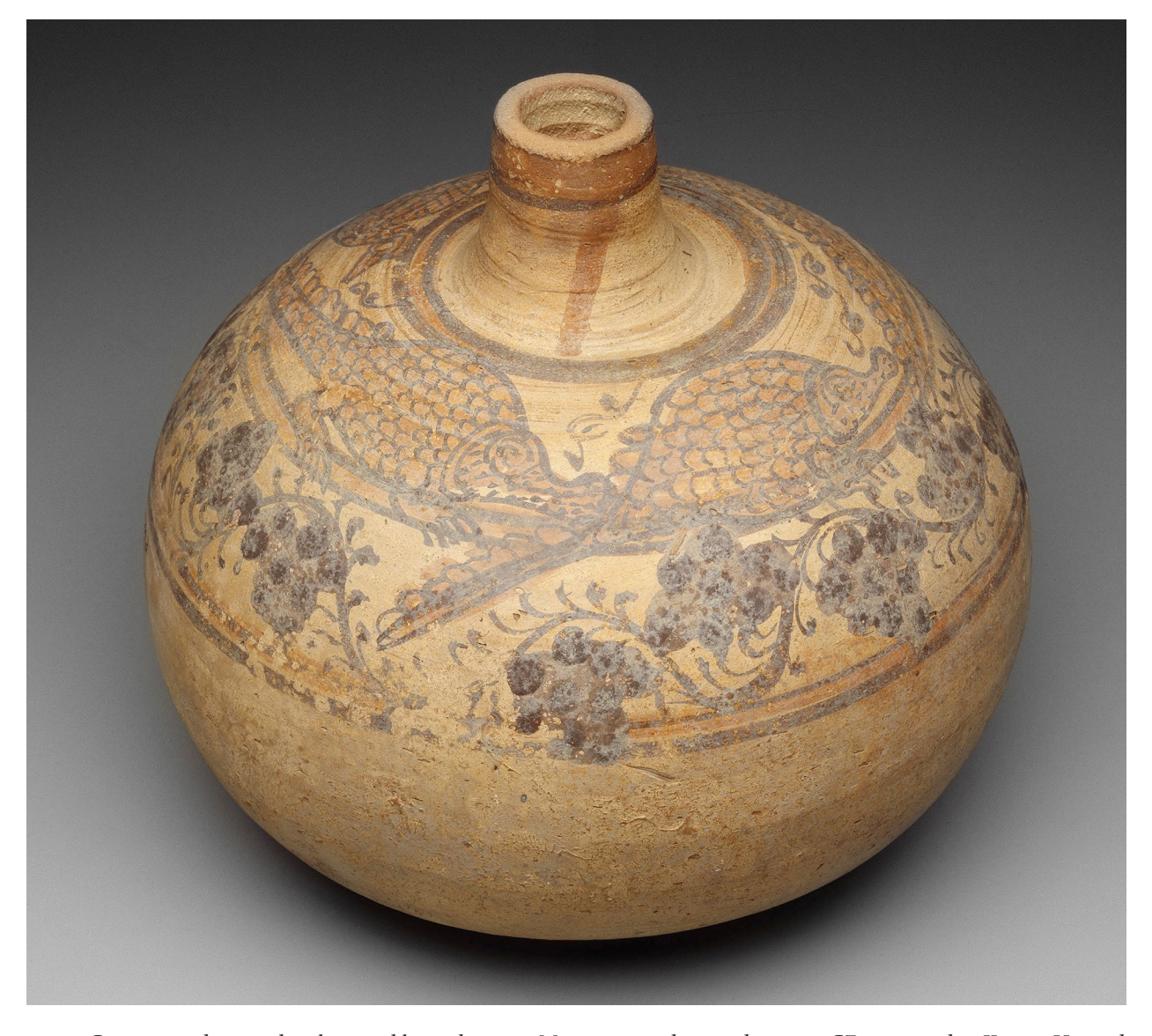
FIG. 5. Ceramic jar decorated with crocodiles and grapes, Meroitic period, second century CE, excavated at Kerma, Harvard University—Boston Museum of Fine Arts Expedition. Boston, Museum of Fine Arts 13.4038.