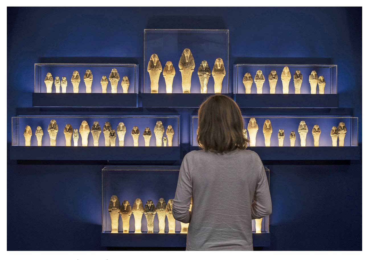
FIG. 4. Funerary figurines ( shawabties ) from kings' tombs at Nuri, as displayed in "Ancient Nubia Now," Napatan period, ca. 700–600 BCE. Boston, Museum of Fine Arts, Ann and Graham Gund Gallery.