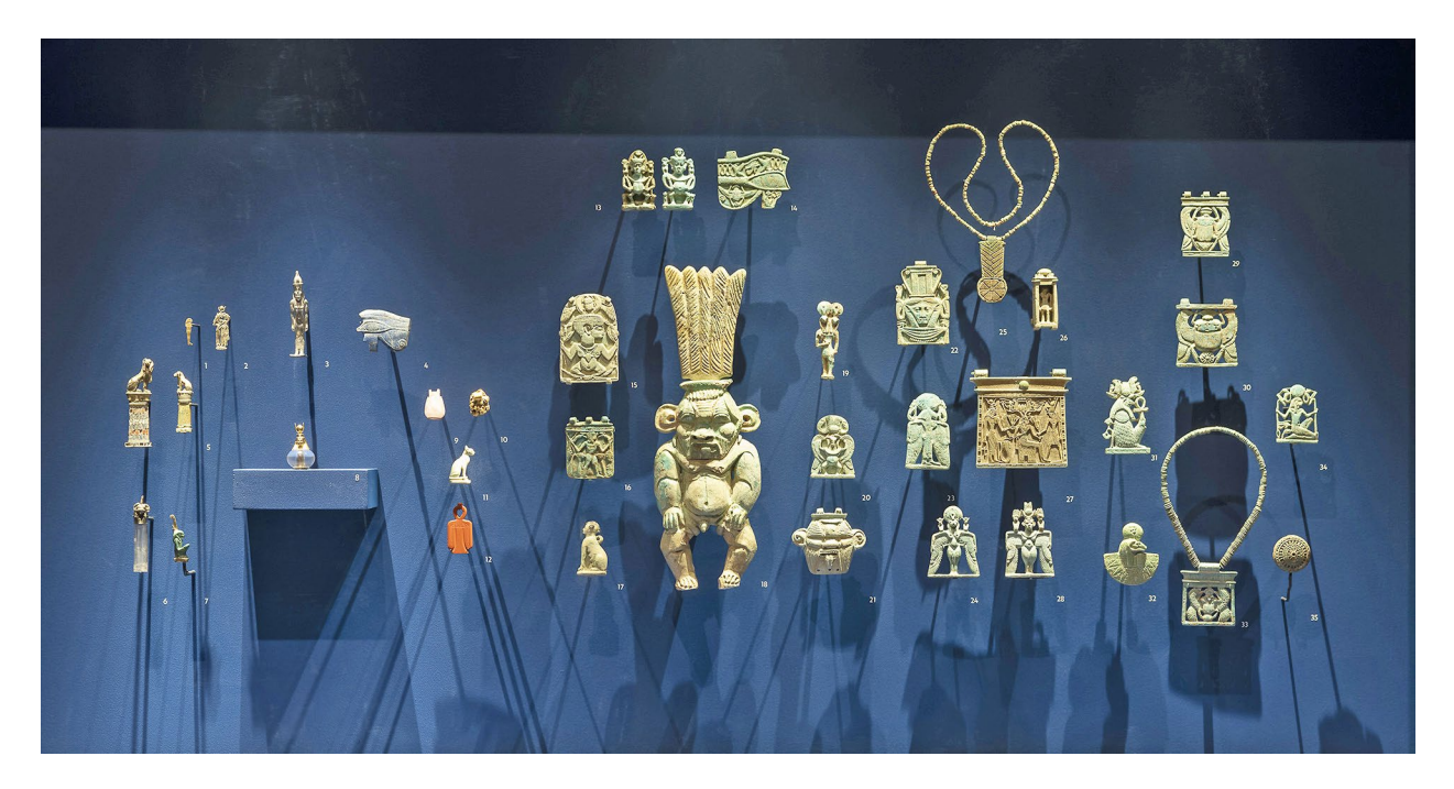
FIG. 3. Faience plaques and other jewelry as displayed in "Ancient Nubia Now," Napatan period, 750–650 BCE, excavated at El-Kurru. Boston, Museum of Fine Arts, Ann and Graham Gund Gallery.