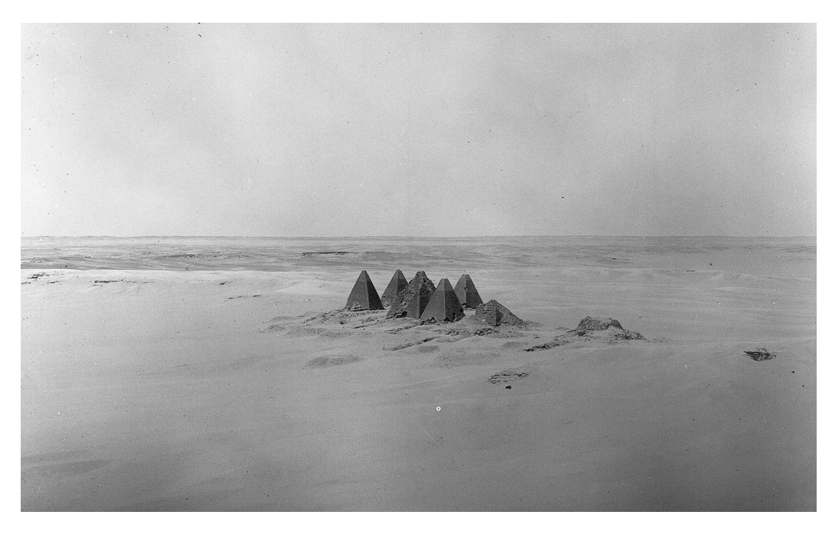
FIG. 1. Pyramids 1–8, Gebel Barkal, photograph by Mohammedani Ibrahim Ibrahim, 19 May 1920, Harvard University—Boston Museum of Fine Arts Expedition (courtesy Museum of Fine Arts, Boston).

Images are not edited by the AJA to the same level as those in the printed article.