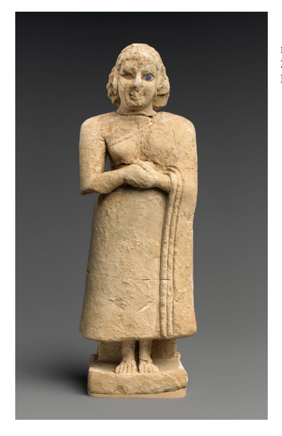
FIG. 4. Standing female worshiper, Sumerian, ca. 2600–2500 BCE, Nippur, ht. 25.2 cm. New York, Metropolitan Museum of Art 62.70.2, acq. 1962, Rogers Fund.