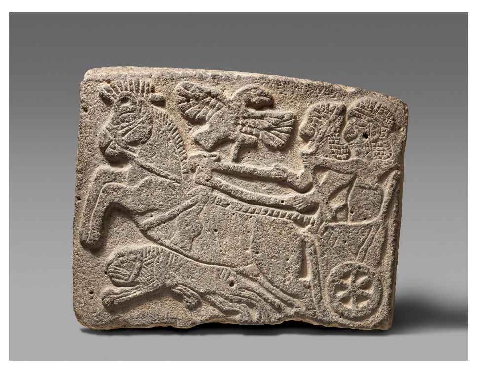
FIG. 5. Orthostat relief lion-hunt scene, Hittite, ca. 10th–9th century BCE, Tell Halaf, Syria, ht. 56 cm. New York, Metropolitan Museum of Art 43.135.2, acq. 1943, Rogers Fund.