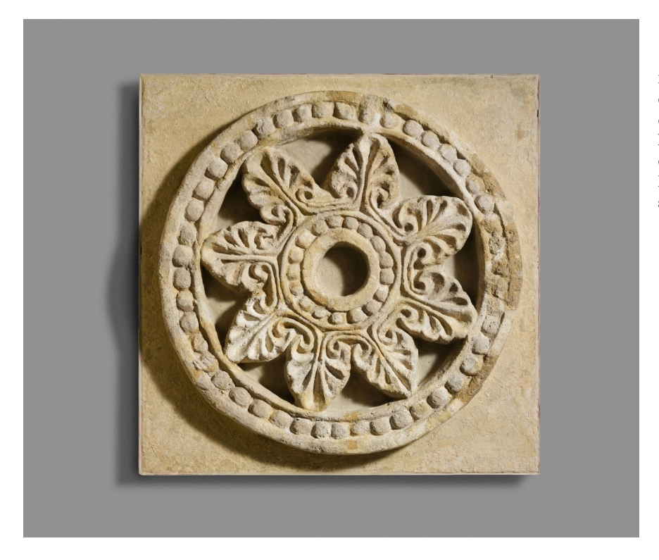
FIG. 3. Architectural roundel with radiating palmettes, Sassanian, late sixth century CE, Ctesiphon, ht. 62.2 cm. New York, Metropolitan Museum of Art 32.150.1, acq. 1932, Rogers Fund (courtesy Metropolitan Museum of Art).

FIG. 2. Glass jug by Ennion, Roman, first half of first century CE, ht. 18.4 cm. New York, Metropolitan Museum of Art 17.194.226, acq. 1917, gift of J. Pierpont Morgan (courtesy Metropolitan Museum of Art).